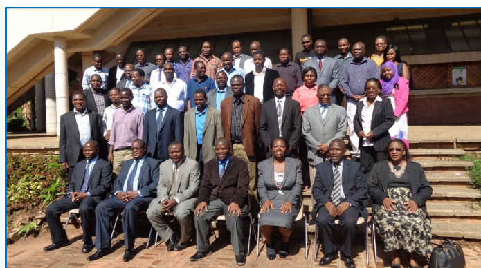
Participants of the Science curriculum review stakeholder workshop

representatives from ESCOM, ILLOVO, NICO Technologies, Ethanol Company, National Bank of Malawi, WM Chirwa & Associates, National Commission for Science and Technology, Makoka Research Station, Parks and Wildlife, Malawi Housing Cooperation, SNDP, National Statistical Office, among many.