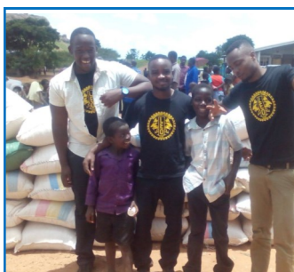
Leo Club students in Zomba

Chanco Leo Club, which is the campus branch of the Zomba Lions Club, was part of the effort to assist flood victims in Chamwali village in Zomba. The villagers have lost houses, property and lives in the heavy January rains. The club contributed firewood, maize flour, and beans.