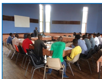
Leadership forum in progress in the Little

maintenance of college infrastructure, and classroom chairs. The leaders lamented the failure of some administrative officers to act on some crucial students' issues; however, the Vice Principal assured them of the open door policy in the management system where the students, through their leadership are free to come and consult management on any issues regarding their