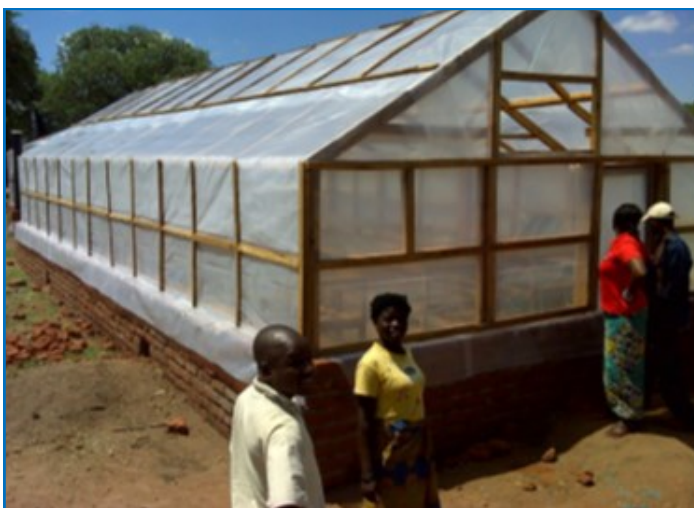
An model of the fish-drying tents to be used in the research project