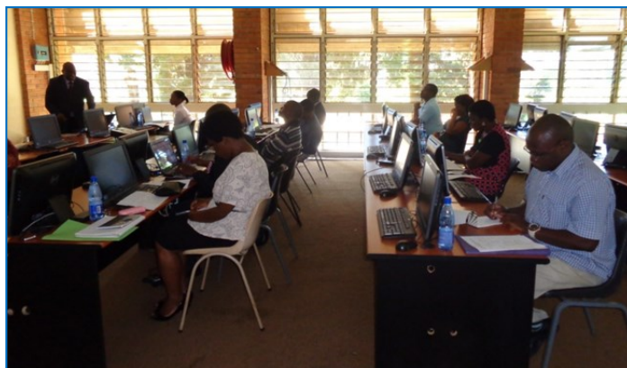
Participants at the CHAREC training workshop

policies, guidelines, functions of RECS, research coordinating committees, functions of a secretariat of a REC, REC standard operating procedures, conflict of interest and its management by REC, vulnerable populations in research and many more.