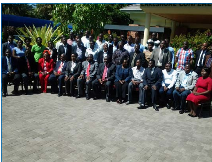
Heads, Deans and Directors in a group pose at the Leadership Training Workshop.