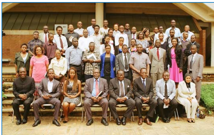
Participants at the pre-budget consultation meeting, posing for a photo shoot outside the Great Hall.

and the dry spell that is anticipated to affect the 2015 yield; making it difficult in prioritization of budget votes in this year's budget. The Ministry usually conducts such consultative exercises before drafting the national budget.