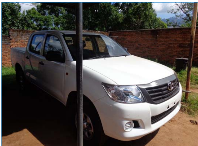
The vehicle donated by UNICEF to CERT