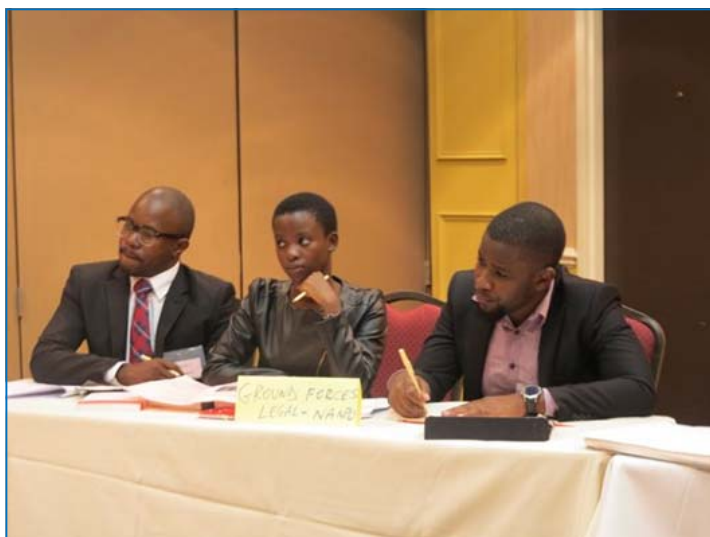
Faculty of Law students at the Jean Pictet International Humanitarian Law Moot Competition.

The trip was funded by the International Committee of the Red Cross (ICRC) Zimbabwe Office. Globally, 56, out of 105 teams that sent in applications, were selected to go to Virginia USA. Of the 56, only 7 teams were from the African continent. The selection process was based on essays that were written by the team members. This was the first time for the University of Malawi to participate in this competition in the 27 years of the programme. Our heartiest congratulations to Team Malawi!