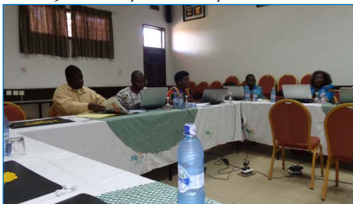
Data cleaning exercise underway at Hippo View Lodge

The launch was spiced by performances by Beni dancers, clad in their recognizable military regalia.