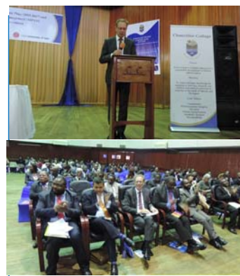
The guest of honour making his speech (above) and participants during the launch (below)