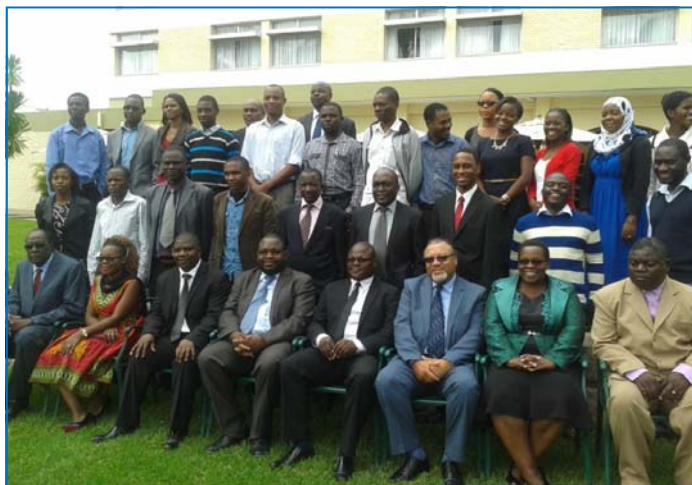
Delegates to the Actuarial Science stakeholders consultative workshop pose for a group photograph.

department got expert comments and advice on the proposed curriculum, which it will incorporate before presentation to Faculty Board, College Management, APC/ACC, and University Senate for approval.