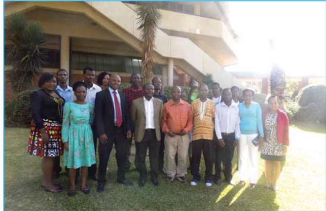
Participants at the workshop pose for a photograph

purpose was to train trainers in creating an Action Research Team that would conduct research on Gender Based Violence, equip trainers to raise awareness and take action that will change negative institutional cultures. Topics covered during the training included, among others, gender sexuality and construction of masculinity and human rights.