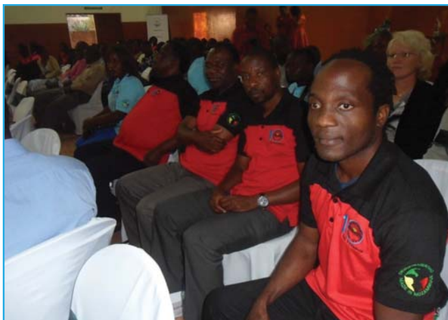
Faculty of Humanities representatives attending the 10th Anniversary celebrations at the Universidade Pedagógica, Niassa

The invitation was also an opportunity for the Faculty of Humanities to strengthen the partnership that exists between University of Malawi and Universidade