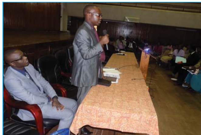
Standard Bank Officials presenting to college staff

For the executive Funeral Plan Policy anyone under the age of 65 with Standard Bank transactional or savings account qualifies for MK4,985 per month and is covered for MK1,000,000. The College is negotiating for special arrangements considering the high number of staff who are likely to join the policy. Full details of benefits can be accessed from the Registrar's office.