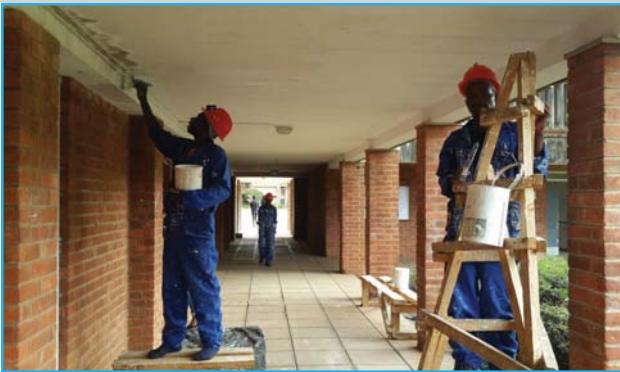
Painters revamping the look of the college corridors

Since the beginning of the semester there has been a lot of work renovating college infrastructure. Although both staff and students bemoan the timing of the renovations, what they cannot deny are the improvements that are being witnessed on campus.