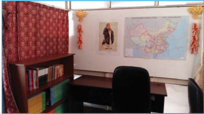
Part of the Chinese Corner in the library

With a Chinese corner and an American corner, Chancellor College Library shines as a site