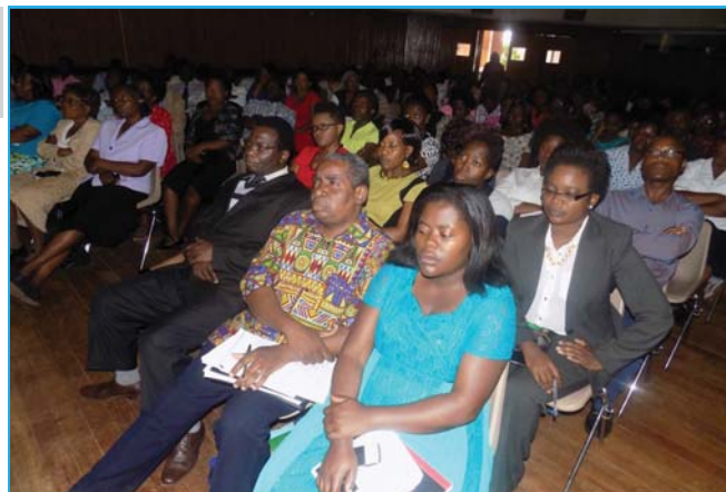
A rapt audience listening to the presentation on the Performance Management System