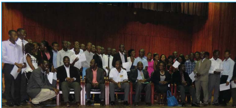
Top scoring students pose for a group photo with the Principal, Vice Principal and Deans

We cannot say much about the future, but we believe today is a good day to be at Chancellor College.