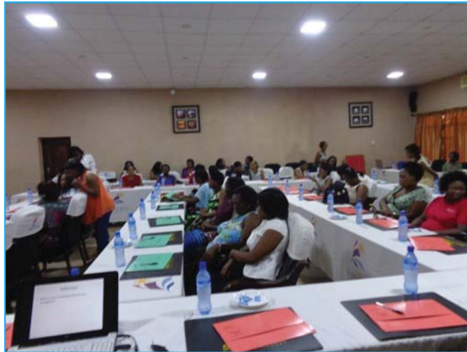
Attentive secretaries during the workshop

It expected that the secretaries will prove to be an asset to the College by increasing productivity and adding value to the institution through their approach to common problems. The College believes that the training was an investment, not an expense.