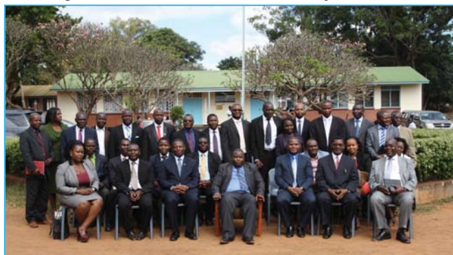
Distinguished delegates during the TV white space handover at Mulanje Secondary School

cellular networks, virtual diagnosis in medicine, early warning and disaster mitigation to name but a few. This technology serves as a very important outreach service which will uplift delivery of educational materials in our secondary schools.