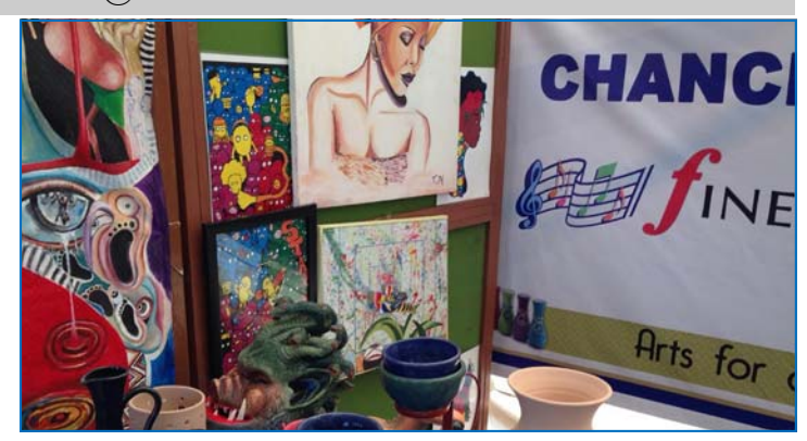
Part of Chancellor College's displays at the UNIMA@50 Celebrations

Out of all of these displays, Chancellor College arguably took the lead with an impressive variety of items to show to the public. The college was represented by a number of departments. The Fine and Performing Arts department brought with them an impressive display of artwork in the form of colorful acrylic and oil paintings on a number of themes. The department also showcased ceramic artwork and sculptures revealing an incredible depth of creativity from the artists. From the same department was an assortment of dances, some original, some blends of locally known These dances songs. included one entitled Kasakaniza (a medley of Mwinowe, Manganje, and Honala), Chintabasale (a mix of Beni, Chisamba, Godo, Manganje, Chimtali, Ingoma, Chiwedewede). However, this was not the only group that performed a dance. Final year students BACOM the programme took to the stage and danced to the Mwezi Wawala song,