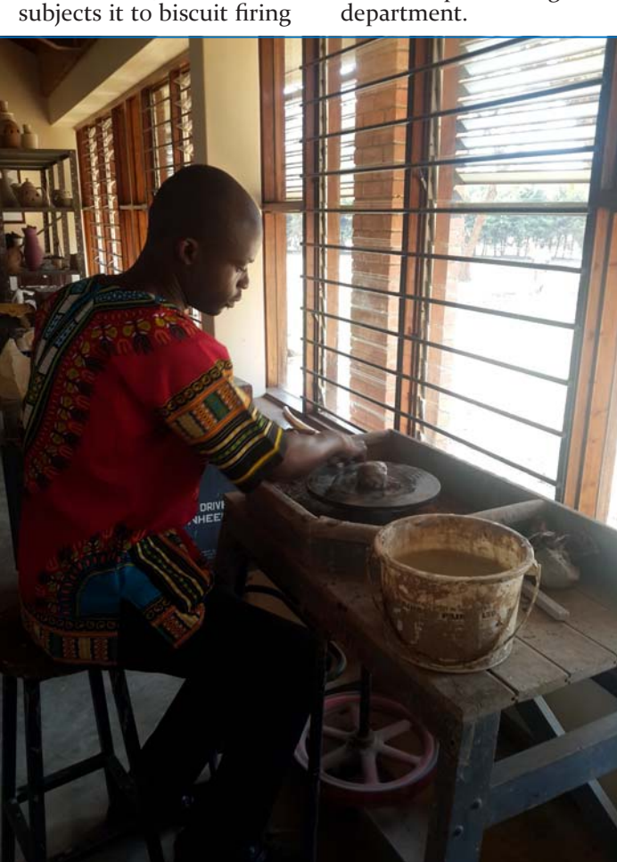
Mtambalika demonstrates use of the potter's wheel

Ceramic pieces by both staff and students are currently on sale in the Fine and performing Arts