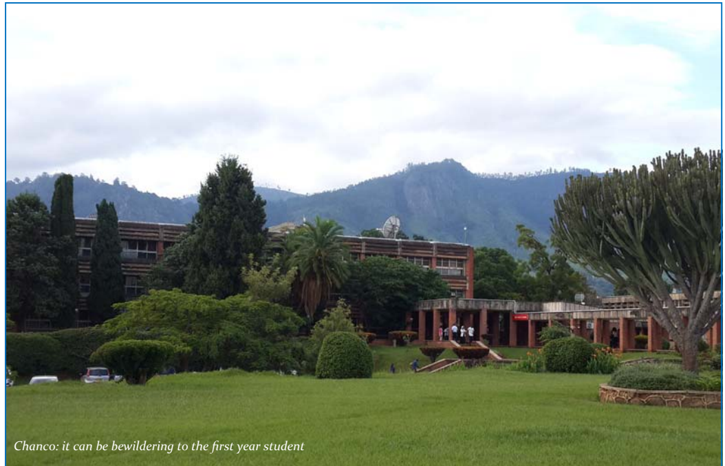
Chanco: it can be bewildering to the first year student

The new year is once again upon us. As we write this, we are facing the hustle and bustle that comes with the commencement of the academic year: sorting out timetable clashes, organizing lectures, recruiting staff, and for our student community, making sure they are properly registered before time is up.