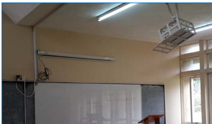
One of the lecture rooms, with the new installations

Classroom application, which may be used by lecturers and their students. The ICT Section has been conducting training in the software since December 2015.