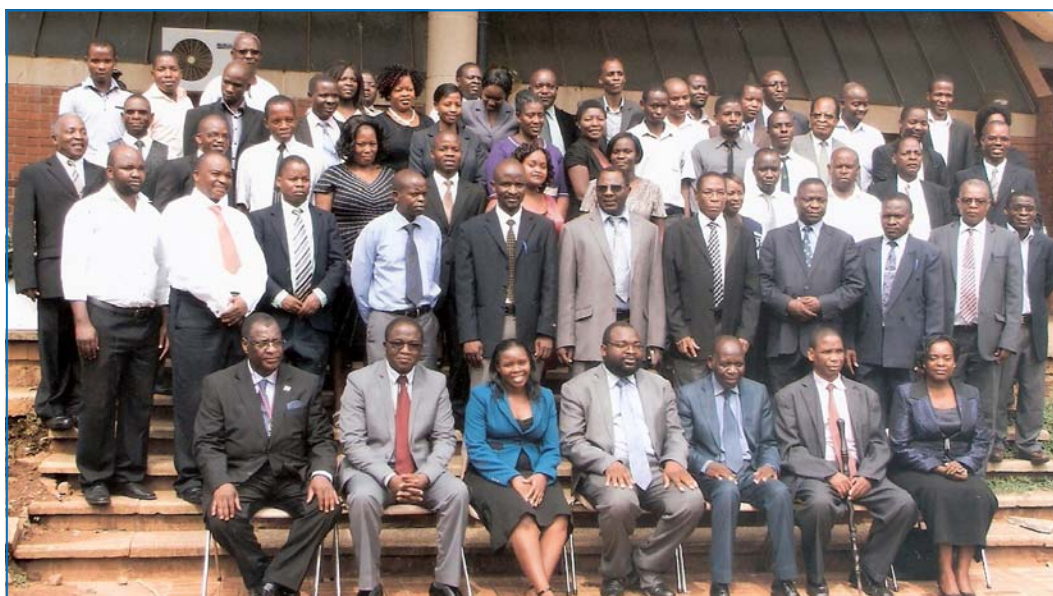
Posing for a group photo: participants of the Faculty of Education Curriculum Review

In response to these gaps, participants recommended that there is need for a clear national level Philosophical Framework for Education, which will relate to teacher education.