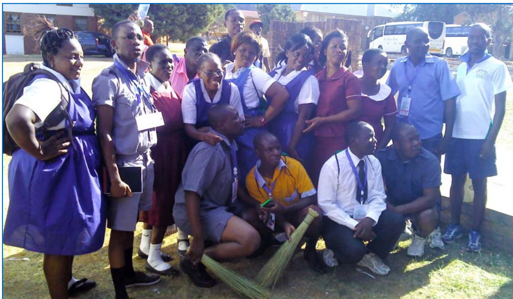
Chanco sportspersons, enjoying 'Back to School Day'

The Chancellor College Staff Sports Association would like to extend a special message of gratitude to the Faculties of Law, Education and Social Science for their financial contributions.