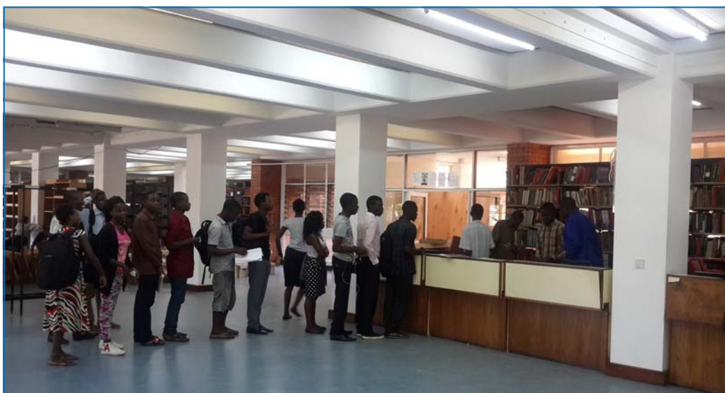
Students line up to get books from the Reserve section in the library