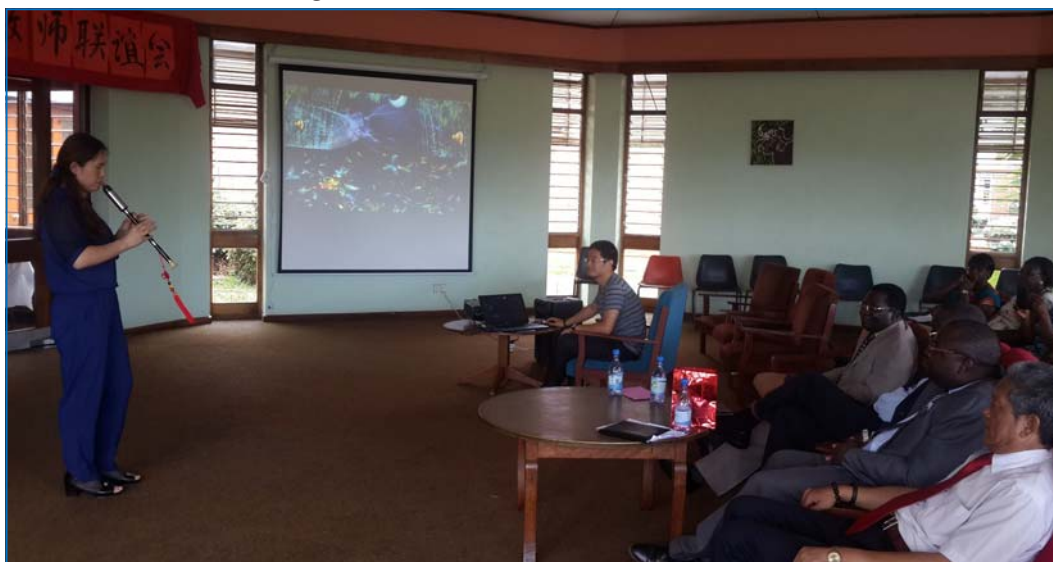
The audience, mesmerized by a bawu performance from a member of the Chinese delegation

partnership between Malawi and China. He observed that Chancellor College was already benefiting from the partnership since several people had already travelled to China for short courses.