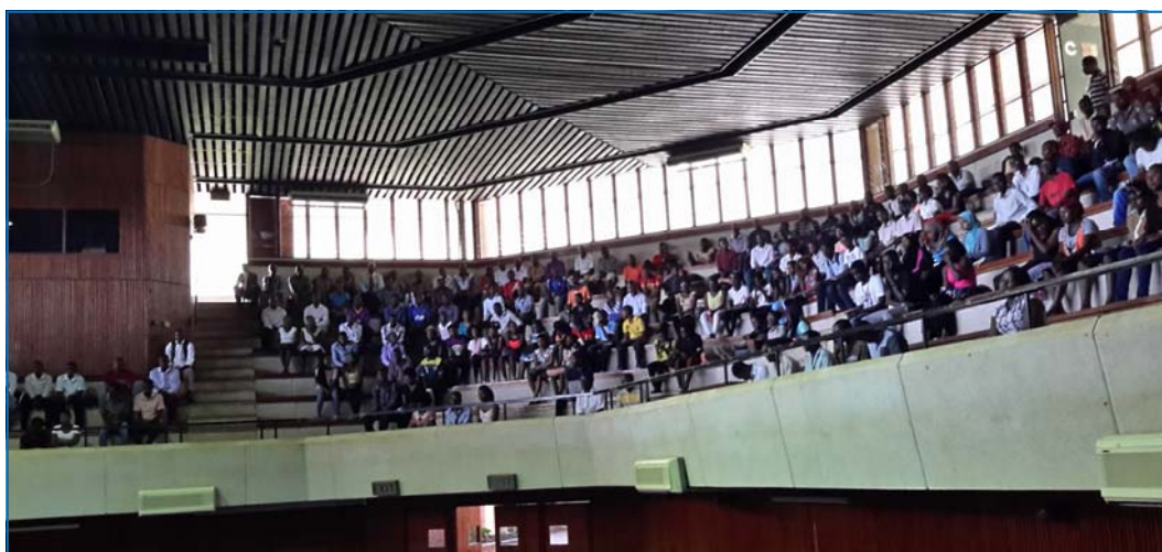
First year students during Orientation in the Great Hall

Students were welcomed to the College and informed on the expectations, given an overview of its structures, introduced to use of ICT services, as well as rules and regulations of the College.