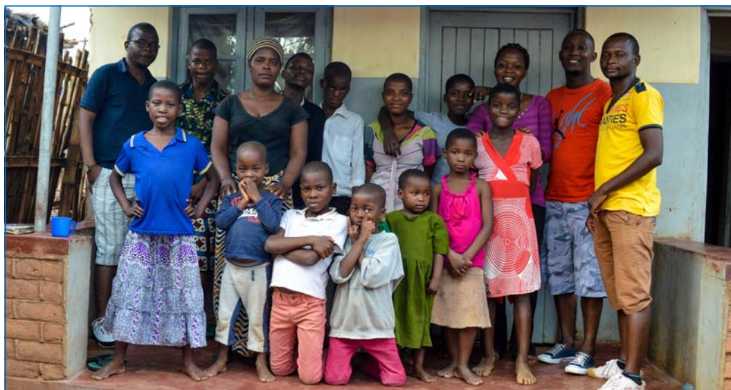
Some of the members of the Love a Child charity group pose with the beneficiaries

and blankets) for the children. The children are also offered psychological counseling. Love a Child welcomes any individuals who would wish to join the charity.