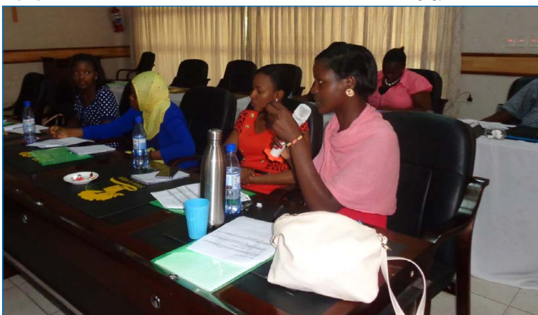
Participants at the CUTL workshop

benefitted from a talk on the use of modern technology to enhance the learning process. Since university students are diverse in age, the workshop also featured a presentation on andragogy.