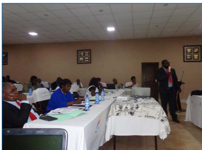
The Principal addresses participants at the planning meeting

The Directorate of Investment and Resource Mobilizations urged Departments and Faculties to have a corporate CV and have Research Agendas as a first step to raising the value and net worth of Chancellor College.