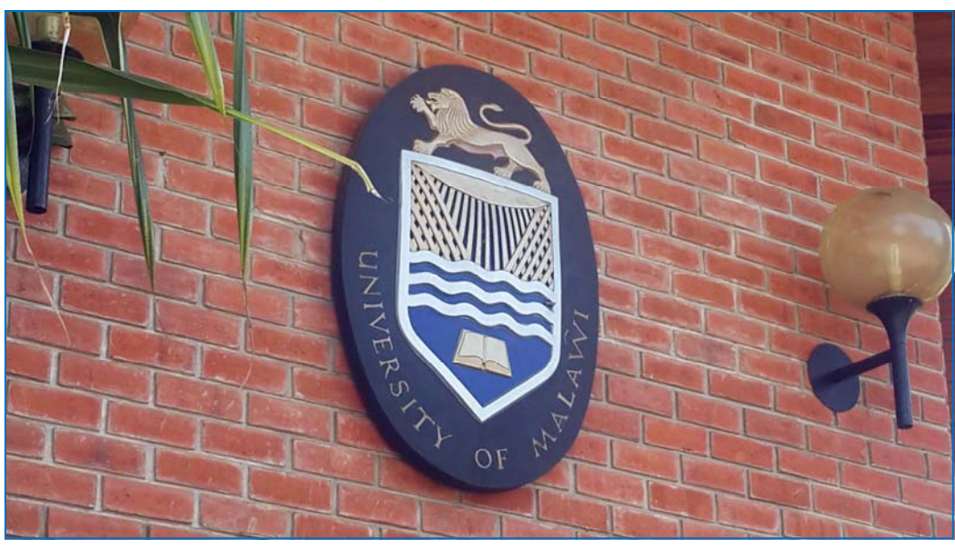
A proud reminder of who we are

In this regard, there is light at the end of the tunnel. The college is due to open in September. We hope we can finish the semester, and indeed the academic year, without further disturbances.