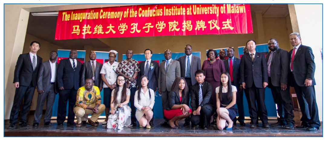
A group photo during the Inauguration ceremony

that the immediate plans are to construct the physical infrastructure of the Confucius Institute at the Kamuzu College of Nursing Lilongwe campus. This will be a worth block around USD6million, 20% of which will be for use by KCN and other UNIMÁ Colleges. The Institute has satellite centres at all colleges of The University of Malawi. Further, the institute will be open to people in the other community, who would be interested in Chinese language and culture, as comparative as African and Asian studies. He also pointed out that the Institute plans to have a vibrant outreach arm offering services in academic research and technical expertise to the wider public, especially in fields manufacturing, trade and industry.