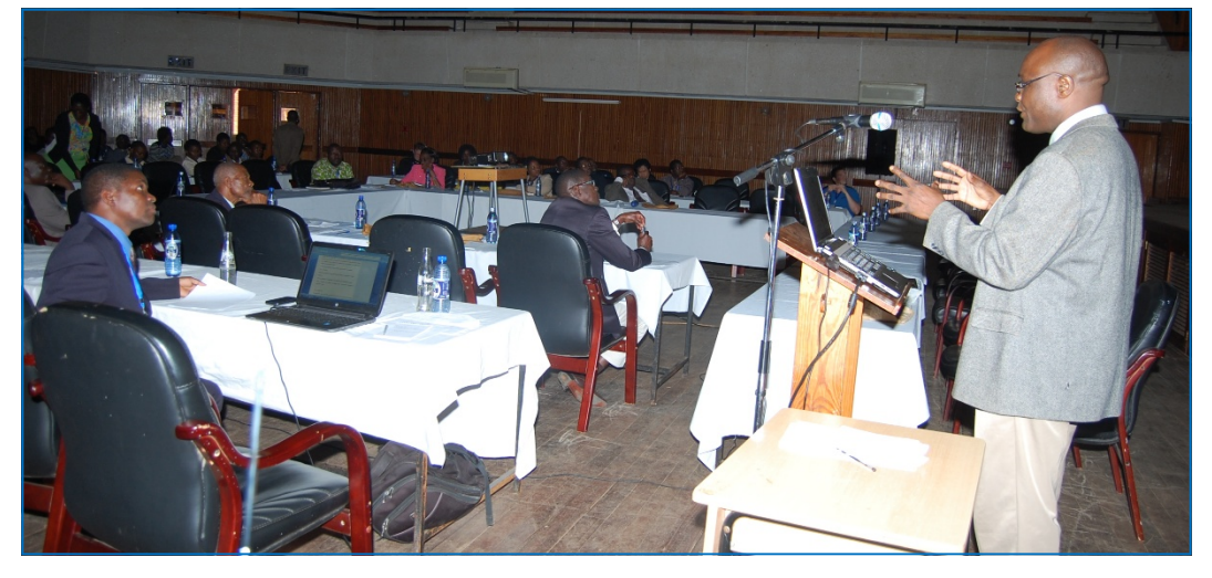
A presentation in progress in the Great Hall

days, Over two participants, who came from the UK, USA, South Africa, Scotland, Botswana, Mozambique, and Malawi presented on different papers.