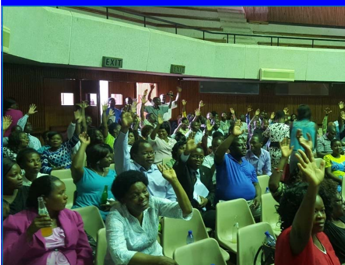
Chanco votes for unbundling

constituent colleges of the university seeking to break away and become fully fledged universities on their own. This is a move that has been met