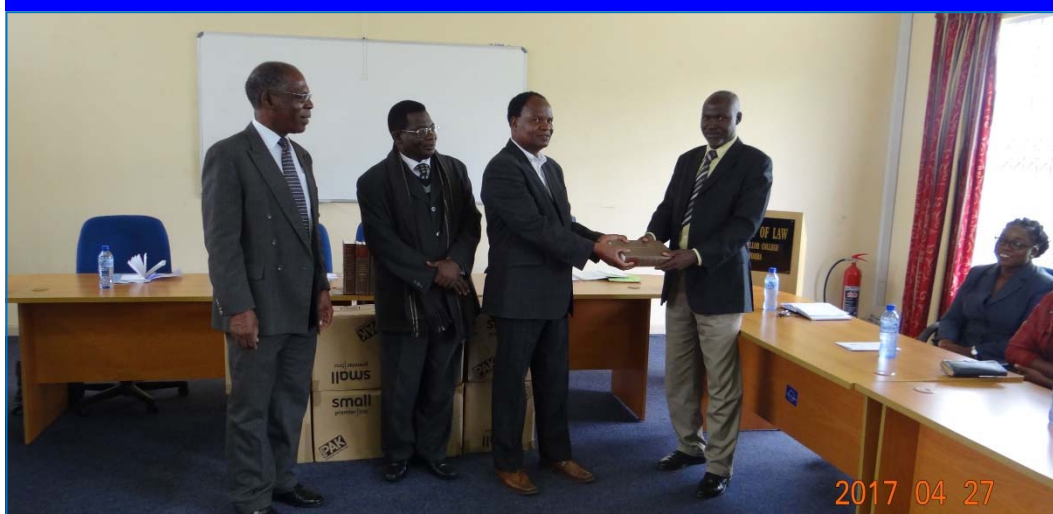
ZAP officials hand over the books to the Dean of Law and the College librarian