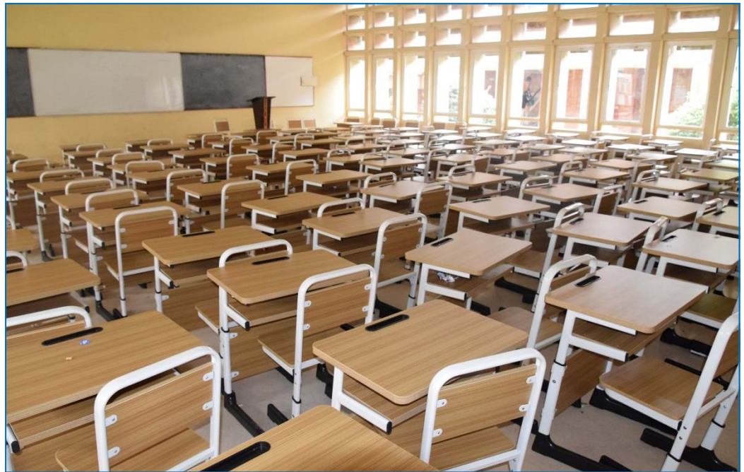
New furniture in the classrooms

Recently, our beloved alumni who graduated in 1994 have promised to uplift the students' reading environment by erecting chairs and tables in a park set-up in the coming months.