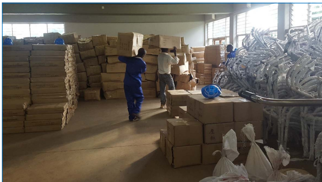
The furniture being offloaded at the Sports Complex

Most of the old classroom chairs have been donated to public primary and secondary schools within Zomba and an official handover ceremony will be conducted in due course.