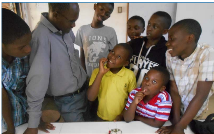
Avid kids solving a science problem

There were also talks given on astronomy. From these talks, participants learnt about the Solar System, with detailed discussions of the sun, individual planets, and moons. On the night of 12th April, 2017 the participants had the opportunity to observe celestial bodies using a telescope. They were able to clearly see Earth's moon with its craters, as well as the planet Jupiter with its moons, and several other stars.