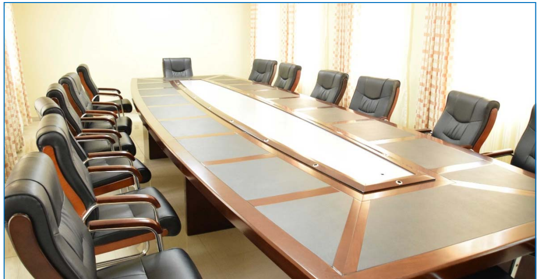
The Faculty of Science boardroom

And the Chancellor College Bulletin will be here to record that growth!