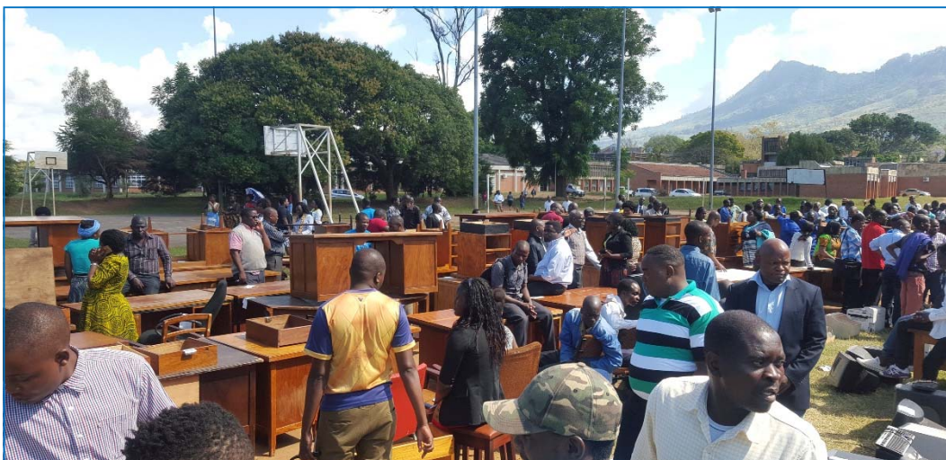
The auction process at the Sports Complex

There was a separate restricted tender process carried out as a way of disposing of college vehicles.