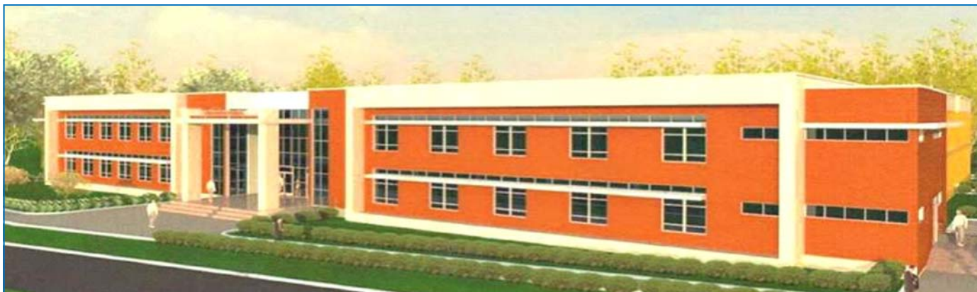
Artist's impression of the School of Economics building

This is a project that will help to ease the pressure of teaching and office space that the college currently faces.