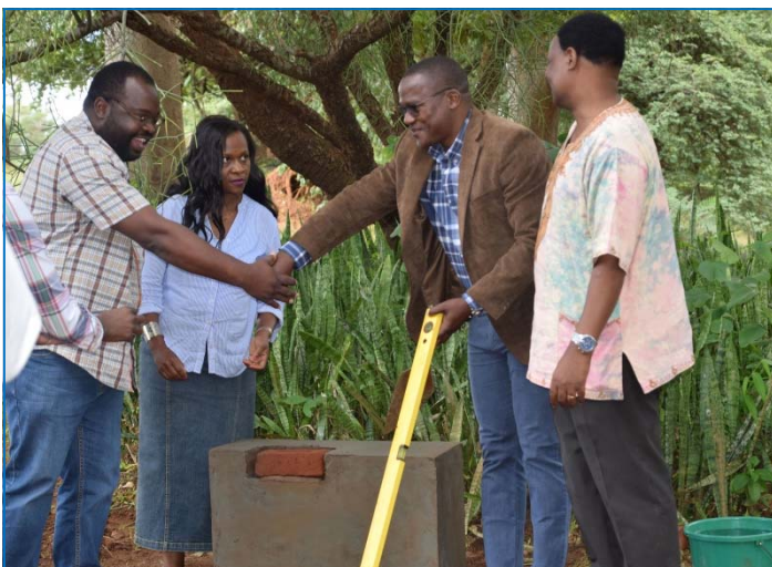
The groundbreaking ceremony