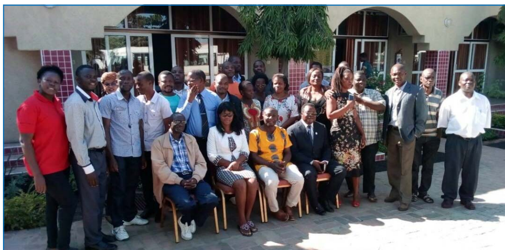
Finance personnel at the training workshop

expanded in all aspects such as systems, infrastructure, students numbers, and projects; hence, the need for such a refresher course. The College community should thus expect improved service delivery from the Finance section having undergone this refresher course.