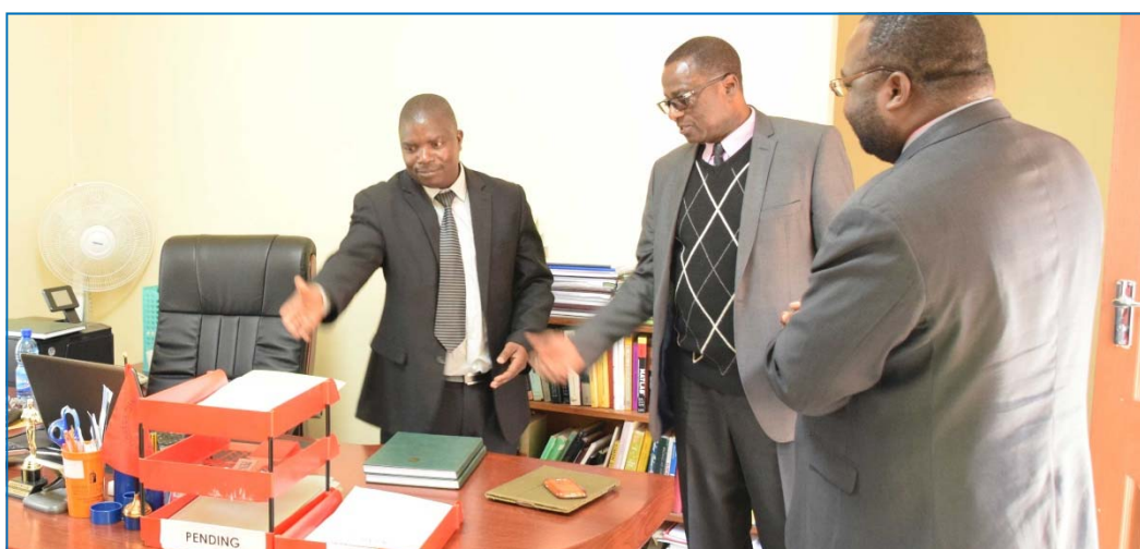
The Dean of Science shows off his new office