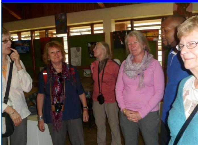
The guests visit the FPA studio

a group of artists from the United Kingdom, visited