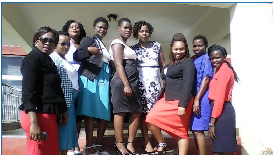
The secretaries pose for a photo during the workshop

Due to increased demand, a second cohort of secretaries also attended the training at the end of June, 2017.