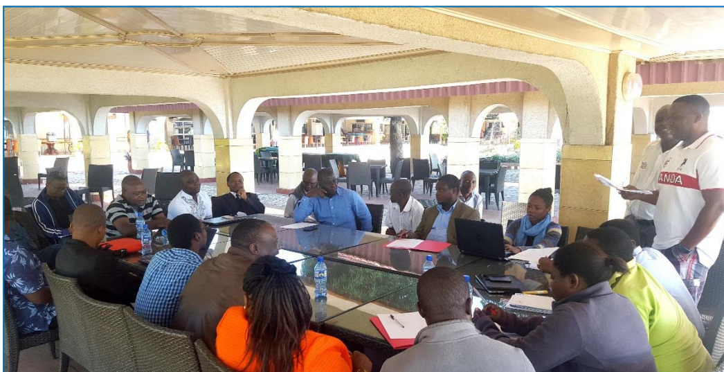
Chancellor College Heads of Departments discussing the Performance Management System

In the discussions, the participants queried some parts of the performance management system, including the process that led to its approval, and the use of outdated job descriptions.