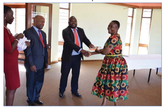
The Principal presents a book to one of the beneficiaries, during the handover ceremony

books from the college the The benefiting schools and communities are from different parts of the country, including