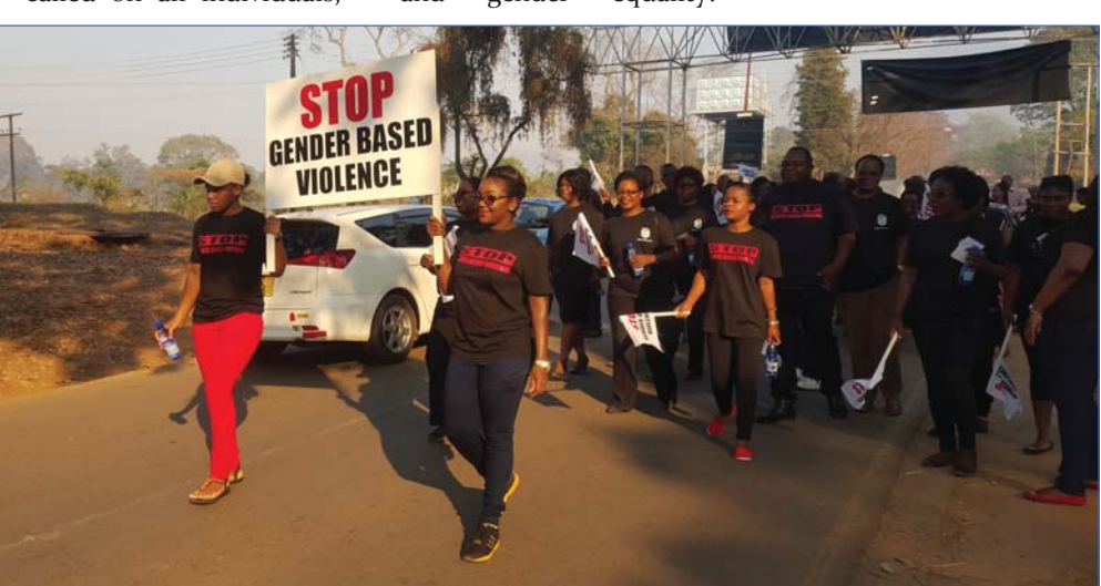
Marching against Gender Based Violence

The march was well patronized and supported by Chancellor College management, academic members of staff, students and Chikanda community leaders.