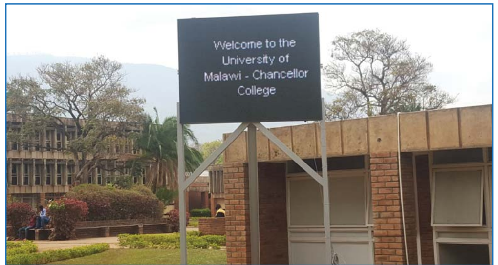
The electronic billboard

The student body, through the SUCC executive, has since expressed appreciation for the billboard, which has eased access to some crucial information.