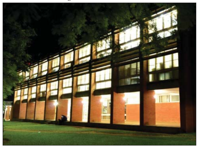
The library at night

Students are bound to take advantage of the new operating hours even more as the exam period commences.