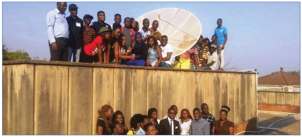
Students and staff pose next to the antenna on the roof of the GIS lab in the department

monitoring research in Malawi and Africa. The products being downloaded by the equipment are archived in the Department and are freely available for application to all.