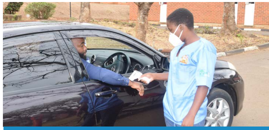
Checking temperature at one of the carparks

The initiative to engage nursing interns is a direct response to one of the requirements from the Ministry of Education for safe reopening of the College which will see the nursing interns stay at the College for a period of five months.