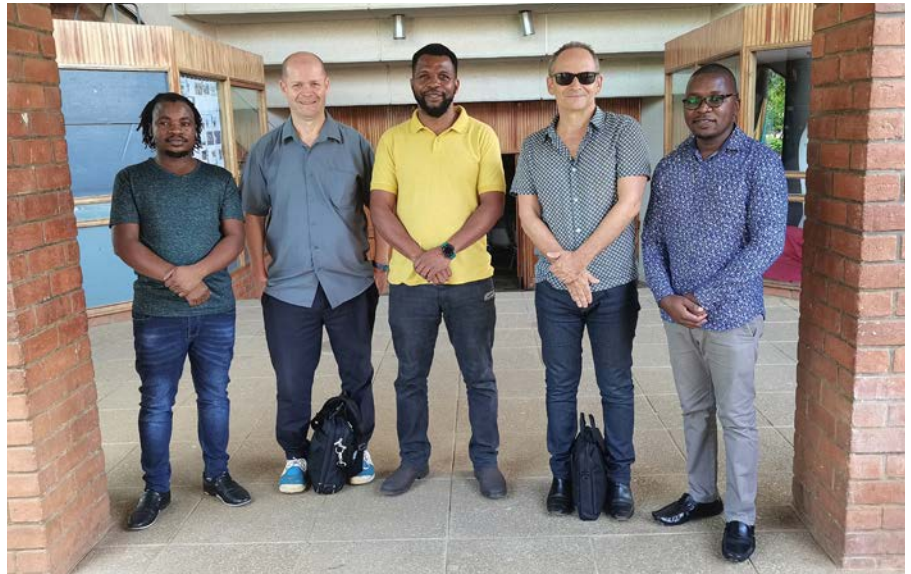
Members of staff in the French Section with visitors from the French Embassy

Further, Mr. Deschamps acknowledged the important role that UNIMA lecturers in the French language continue to play pertaining to the promotion of the language