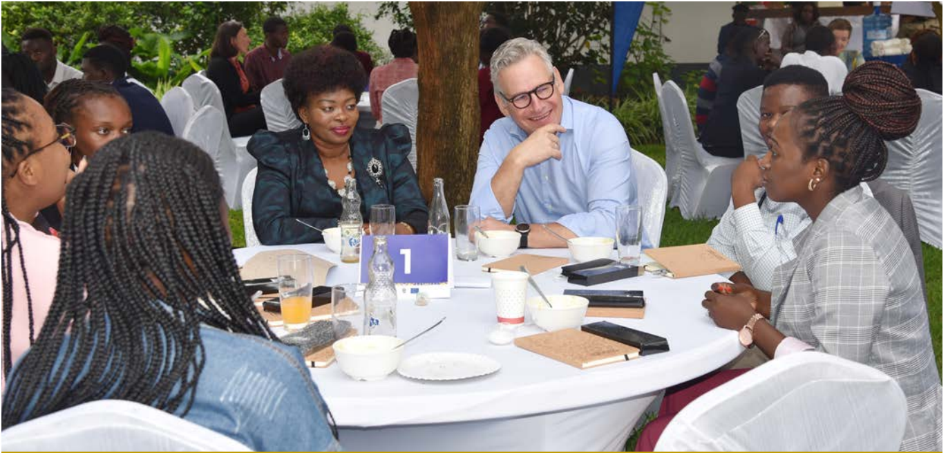
Students engaged in discussions with the EU Ambassador at his residence