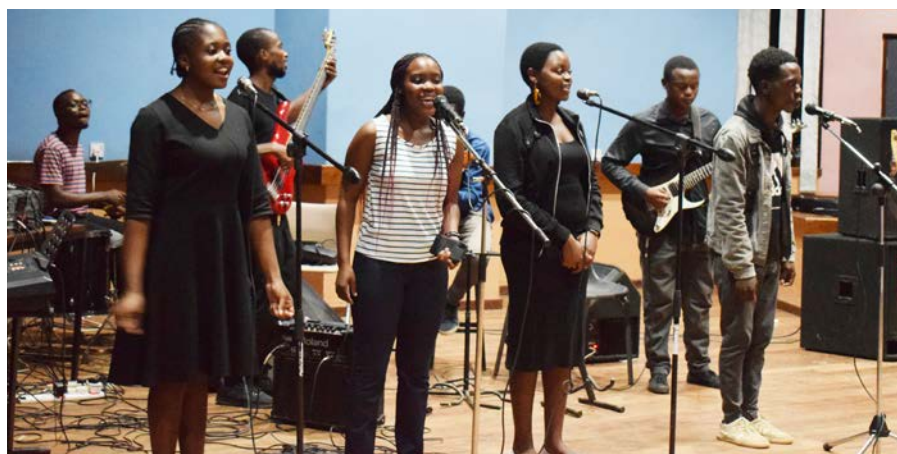
A music performance by the Zebras Band during the ceremony

Apart from promoting quality education, the University of Malawi is also interested in creating a diverse and vibrant artistic community. The university’s School of Arts, Communication and Design has been promoting the arts through various projects in the past, such as the Brother 2 Brother programme and the SULA project.