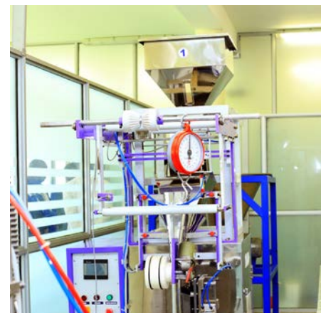
Some of the equipment on display at the MUST lab

“We cannot assume that we know everything. Therefore, this partnership underscores our great expectation to jointly apply for grants, among other research opportunities,” he said.