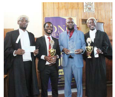
The winning team poses with their law lecturers

The University's School of Law, Economics and Government is a vibrant institution that allows legal students to participate in various activities and societies that keep their minds sharp, and to attune their skills to the needs of society.