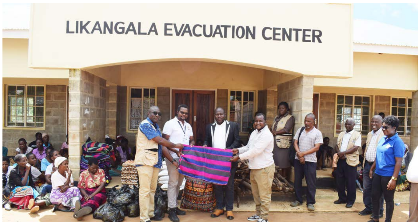
UNIMA staff handing over the provisions to the cyclone victims