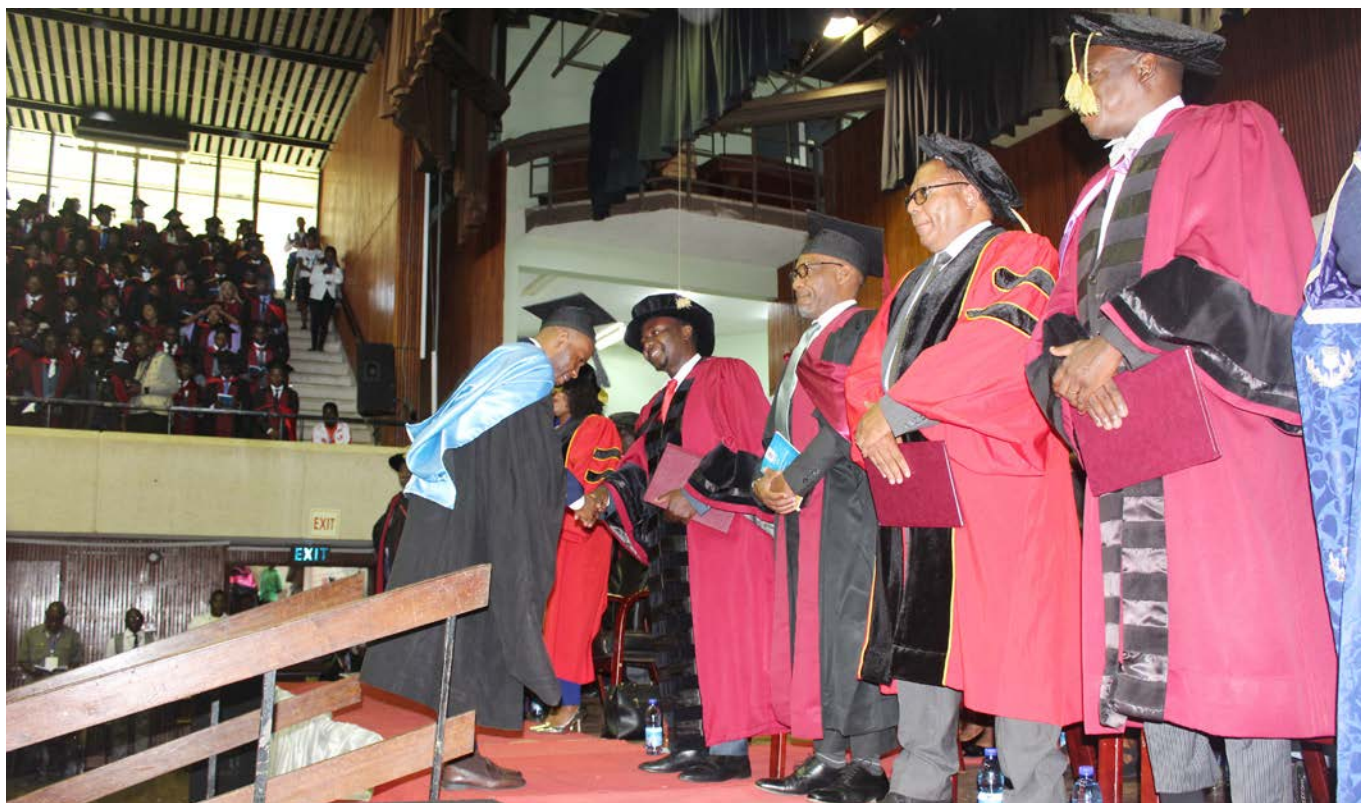
The Vice Chancellor shakes hands with a distinction degree awardee during the ceremony