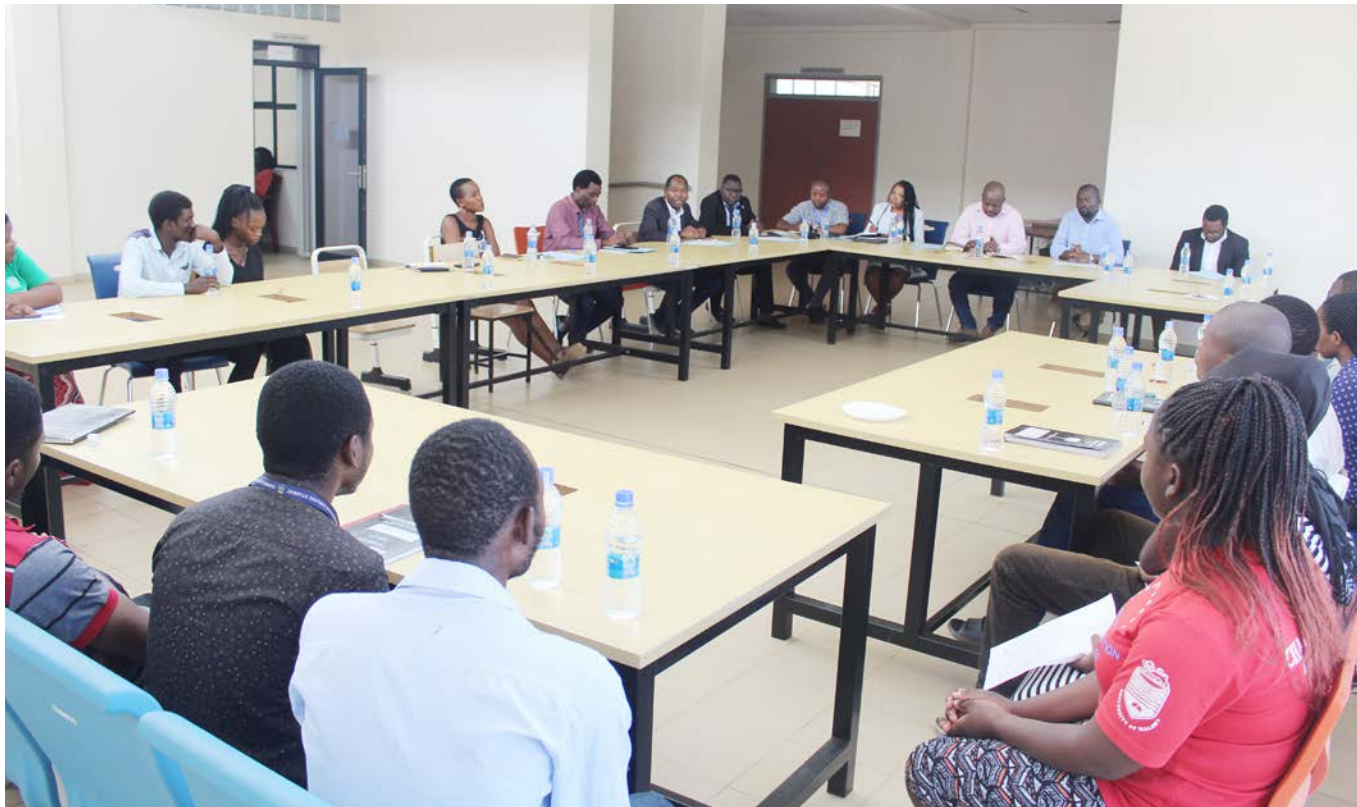
Attendees at the function