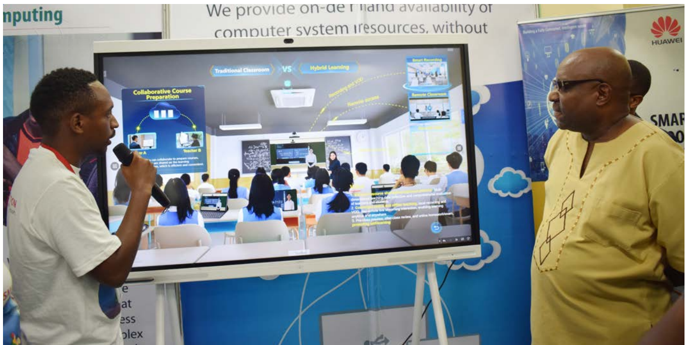
An exhibition of one of the modern technologies available for teaching