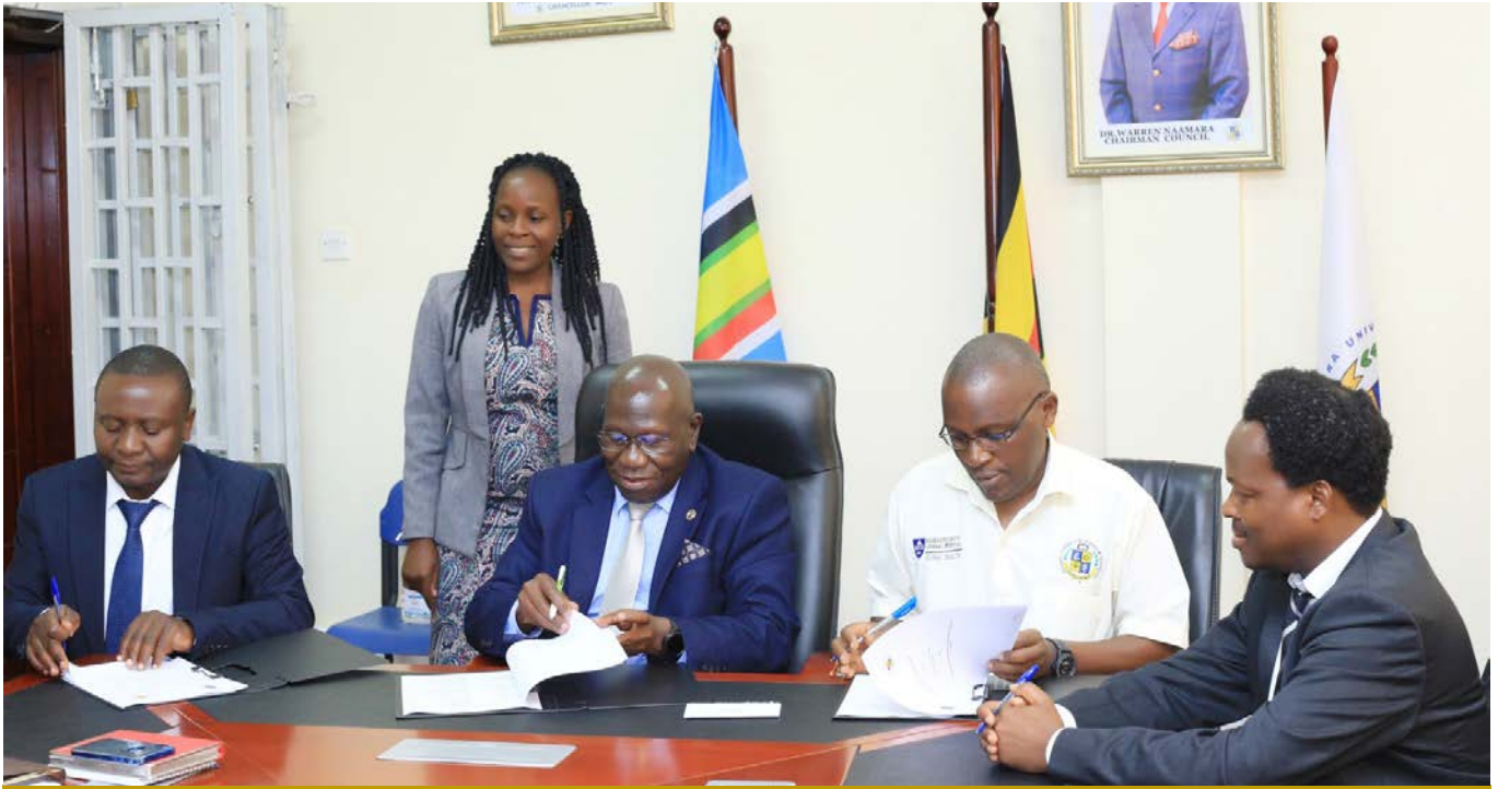
The official signing ceremony