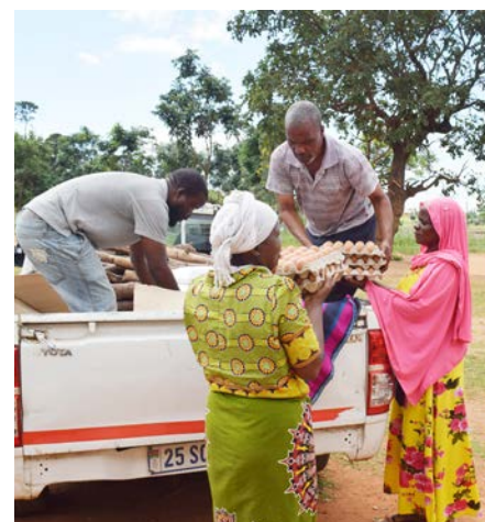
Offloading donated items

This donation reflects the University of Malawi's ongoing commitment to social responsibility and its desire to make a positive impact within the local community during times of need. The University has previously provided support to Cyclone Freddy victims, including a donation of relief items by the UNIMA Academic Staff Union to victims at Mpsupsyu village, Zomba.