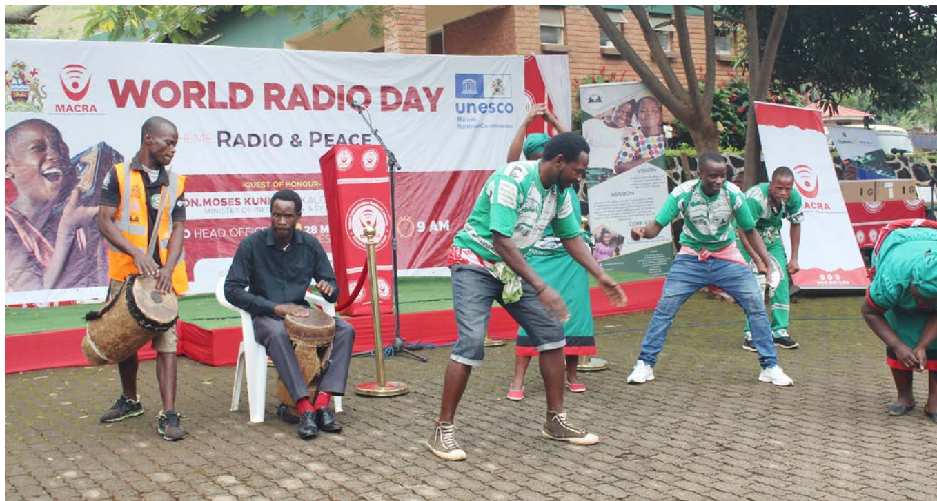
A performance in celebration of radio services in Malawi