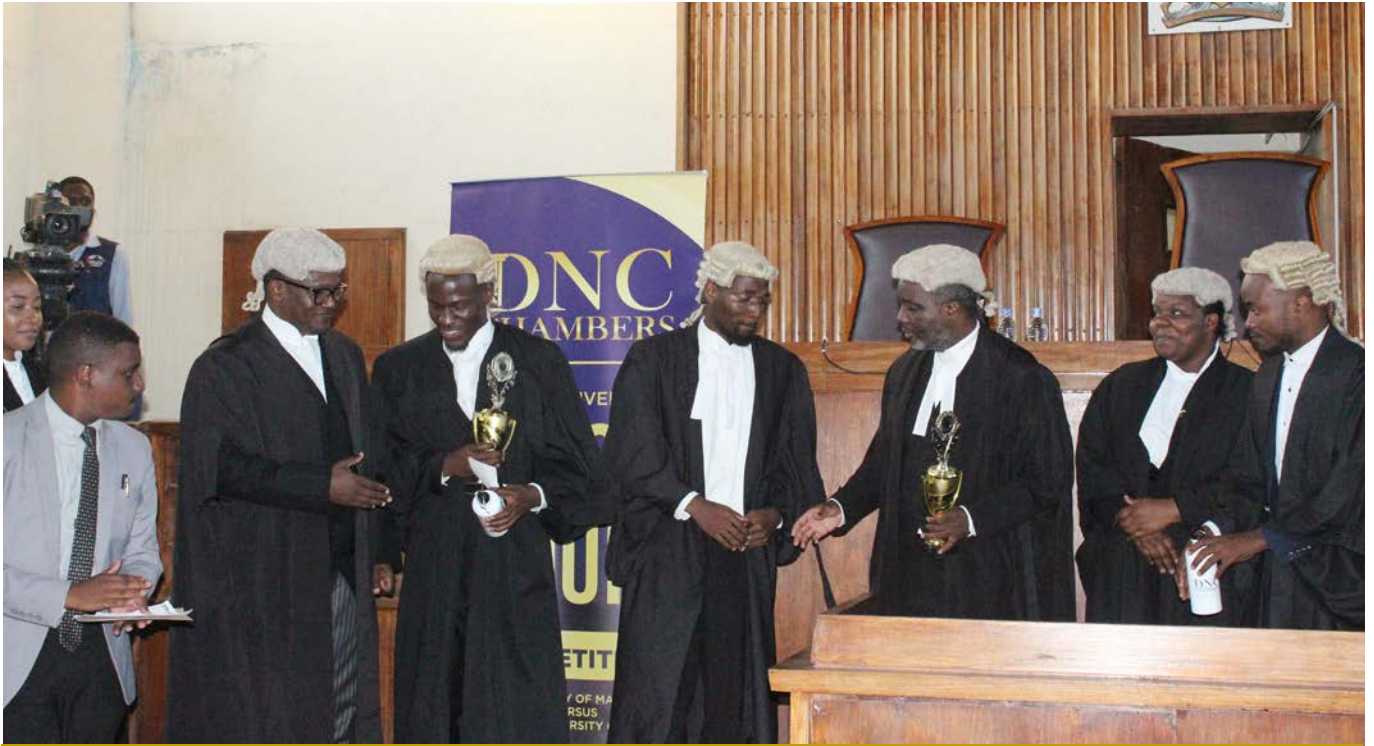
The winners receiving their congratulations