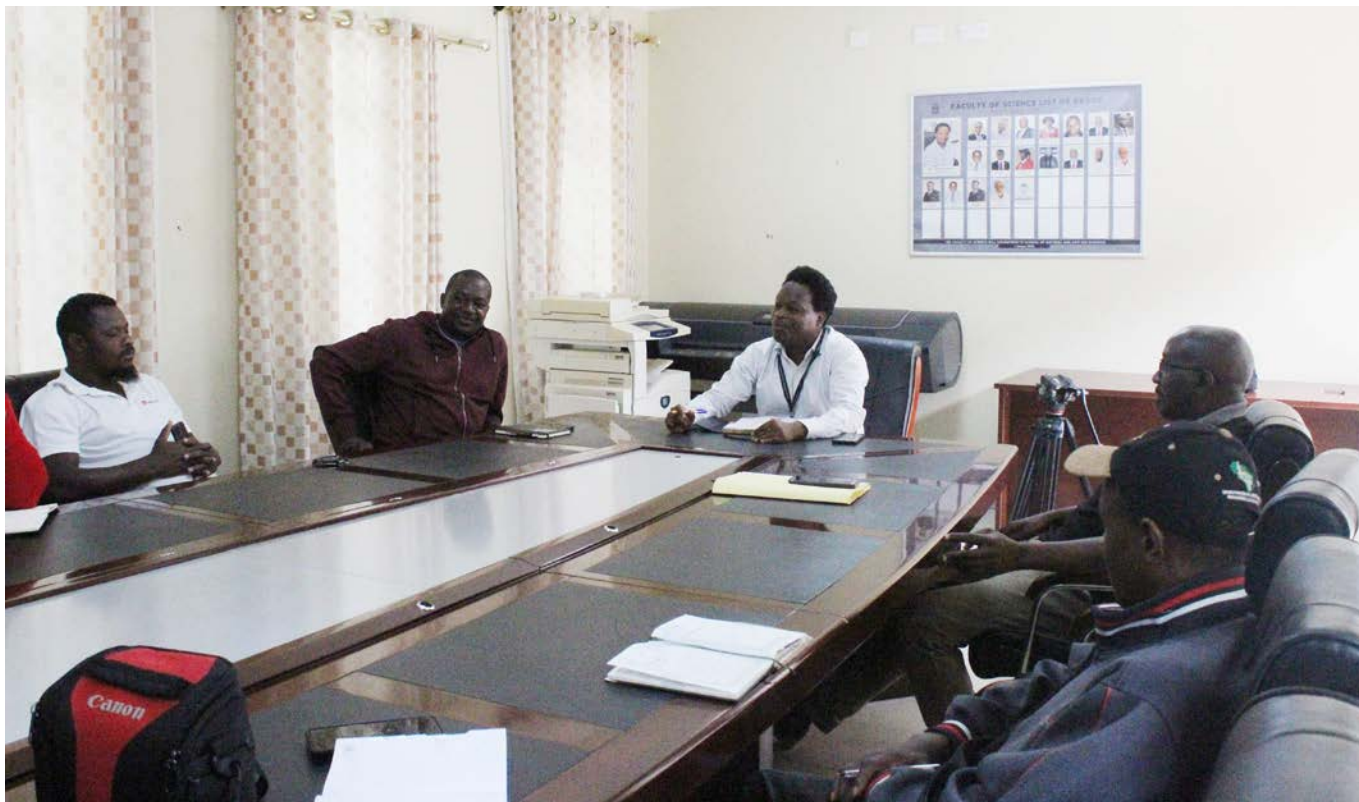
Discussions underway on the improved cotton variety