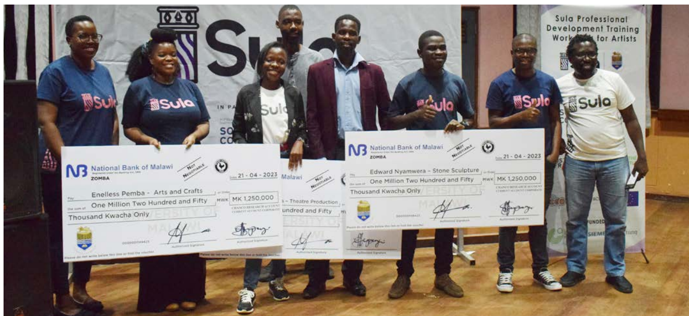
SULA awardees display their dummy cheques