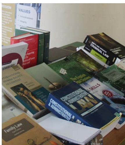
Some of the donated books

This was a momentous occasion for the School of Law, Economics and Government as they received a generous donation of books from Moyo Academy, a purpose-built secondary school for female students in Malawi. It is located in Nkhotakota. The Executive Dean and University Librarian were both delighted, as this donation will increase the performance of the lawyers in training and assist them in their preparation for moot court competitions among other activities.