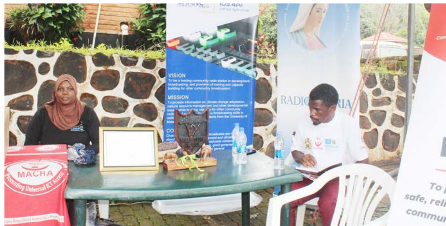
Chanco Community Radio staff

These gifts will help the radio station in the execution of its activities, filling the long-standing gaps that have been there in terms of equipment.