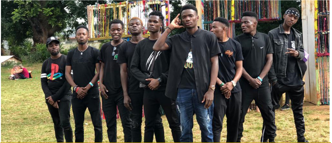
Members of Dance for Change Club

The 2023 Zomba City Festival, which celebrates cultural heritage and the natural beauty of the old capital took place from 28th April, 2023, to 1st May, 2023. During those days, people enjoyed different forms of entertainment and art appreciation. Different students from the University of Malawi had the chance to showcase their skills during this event. Most notable among these performers were students from the Writers Workshop and the Dance for Change Club.