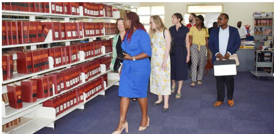
Some members of the Bath Spa delegation touring the McKnight Machika Resource Centre at the Law Section

While at the UNIMA campus in Zomba, they engaged in a number of functions. Fortunately, the visit coincided with a graduation ceremony at UNIMA on 5th April, 2023. Therefore, as a gesture of cordiality, the Vice Chancellor of the University of Malawi invited some of the members of the delegation to join in the procession during the graduation function, where they witnessed the forms of celebration that animate the Great Hall during the function.