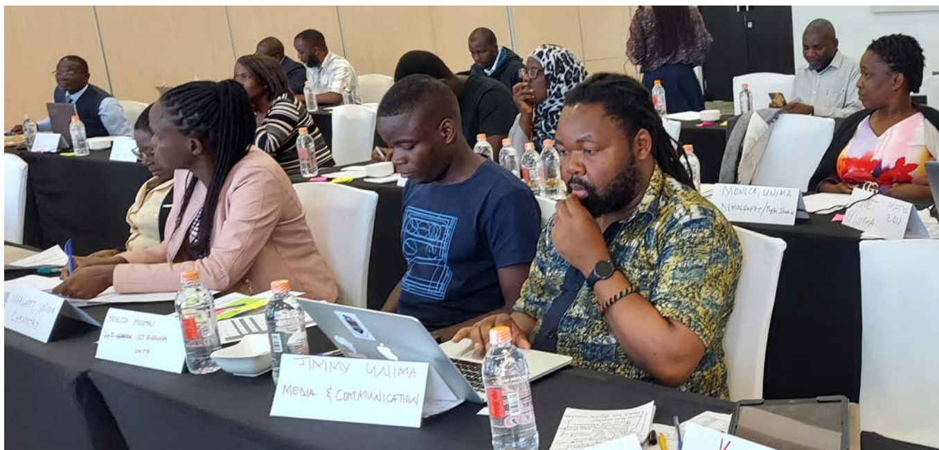
A section of participants at the workshop