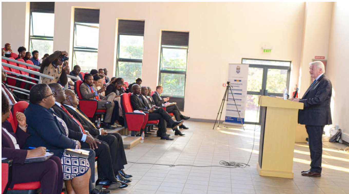
The Right Honourable Lord Chief Justice delivers his lecture