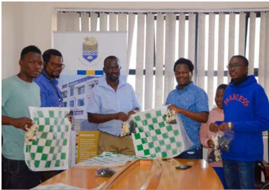
Chess players receiving the donation from CHESSAM

On June 22, 2023, the University of Malawi was among the five education institutions that received chess sets in Zomba. The chess sets were donated by a charity organization called Gifts of Chess from the United States of America. A total of 1,000 sets were delivered to Malawi and distributed to education institutions, prisons, and other reformation institutions through the Chess Association of Malawi (CHESSAM).