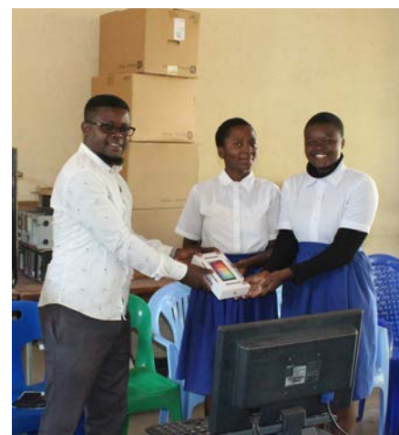
Students from Providence Girls Secondary School excited to receive the donation

Recently, the University of Malawi's School of Education held an Education Technology event that emphasized the benefits of technology in the education sector and how useful it is during times of adversity in the country.