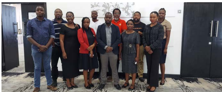
UNIMA representatives pose for a photo