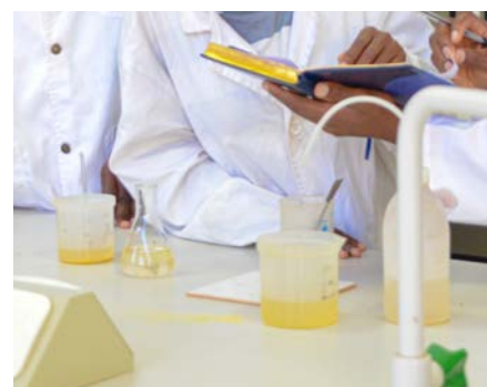
Some of the equipment to be used

The top three teams will get to attend the 67th IAEA General Conference, which will be held in Vienna in September, 2023. The winners will have a discussion as a side-event at the conference, and will also have a chance to visit the laboratories and other facilities to do with nuclear technology.