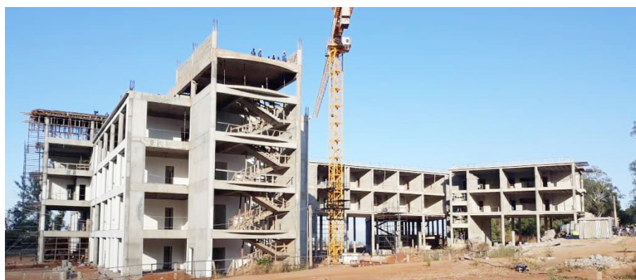
Construction of the new administration block underway

The committee also toured other sections of the campus, including the ICT department and the Mwambo and Chikowi lecture theatres.