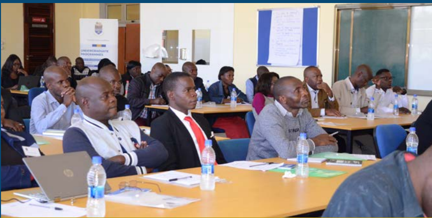
Participants at the records management workshop

From 27th to 29th June, 2023, the University of Malawi, through the university's library management, held a three-day records management workshop for 52 participants from various public and private institutions. The workshop, whose theme was “Ethics and Professionalism in Records Management in the Public and Private Sectors”, was hosted at the New Economics section of the campus.