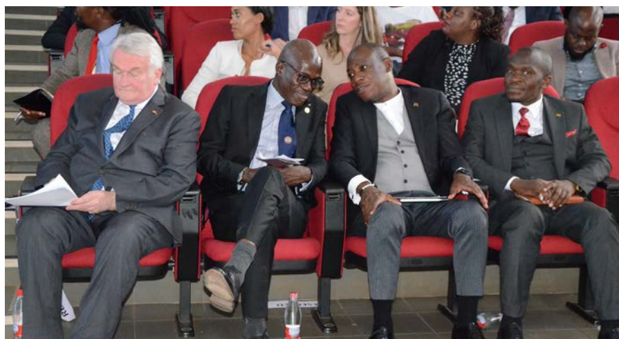
The Deputy Vice Chancellor (2nd from right) engages with other members of the legal fraternity at the function

The Right Honorable Lord Burnett concluded his remarks by presenting the University of Malawi with an original document of the Magna Carta, a significant human rights document signed by the Lord High Chancellor of Great Britain, the President of the United Kingdom Supreme Courts, the Master of the Rolls, and the Lord Chief Justice of England and Wales.