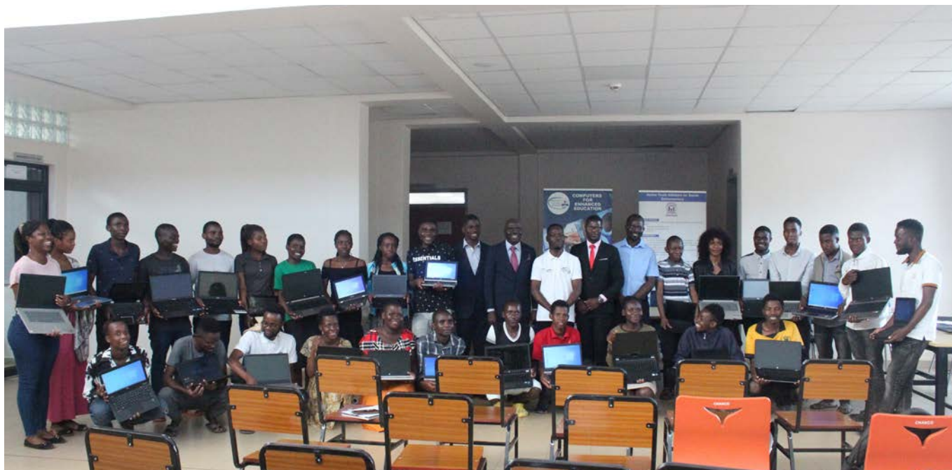
Laptop recipients pose for a picture