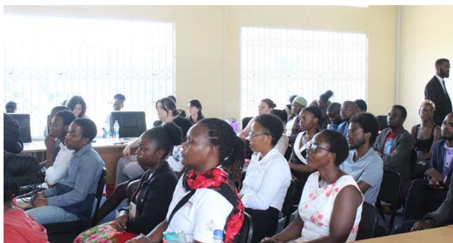
An attentive audience at the Law boardroom

The visitors also had an opportunity to visit some beautiful places and appreciate nature. They went hiking at Chawe in Zomba, and also visited Nkopola in Mangochi, where they marvelled at the beauty of Malawi.