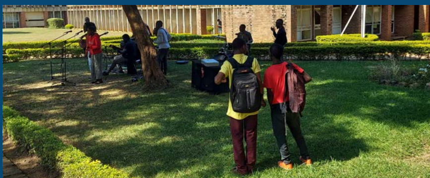
A music performance at the Library Quadrangle

The University of Malawi prioritizes the welfare of its students, recognizing that their health is crucial for its overall excellence. In an effort to combat suicide cases on campus, on May 17th, 2023, the University of Malawi launched