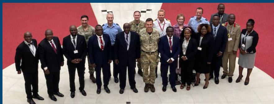
The Malawi delegation poses for a photo at the Defence Academy

development courses for military officers, defense professionals, and MOD civil servants. The Academy comprises several constituent colleges and schools, each specializing in different areas of study and training. Notable institutions within the Defence Academy include the Joint Services Command and Staff College (JSCSC), Royal College of Defence Studies (RCDS), Defence College of Management and Technology (DCMT), and Defence Academy Centre for Education and Research (DACER).