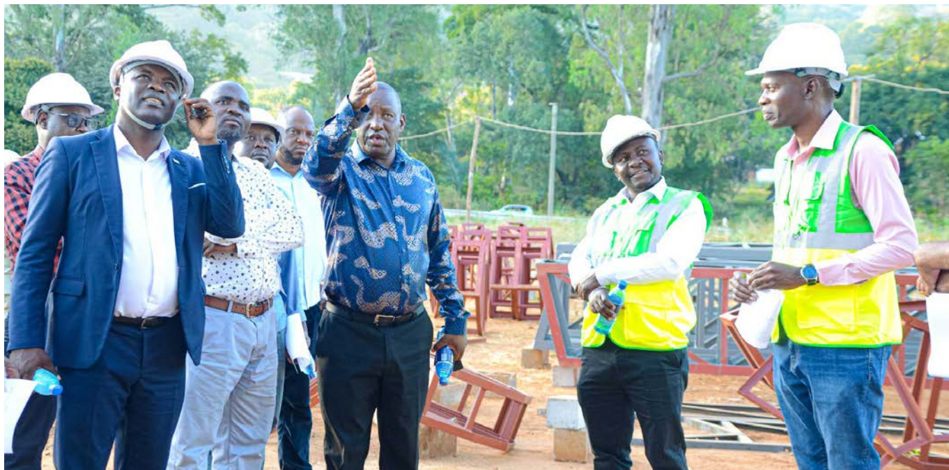
Parliamentarians appreciate a construction project at UNIMA