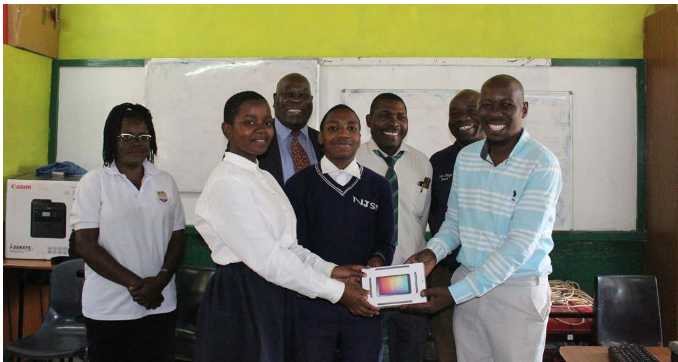
Smiling faces: The tablet presentation ceremony at Njamba Secondary School