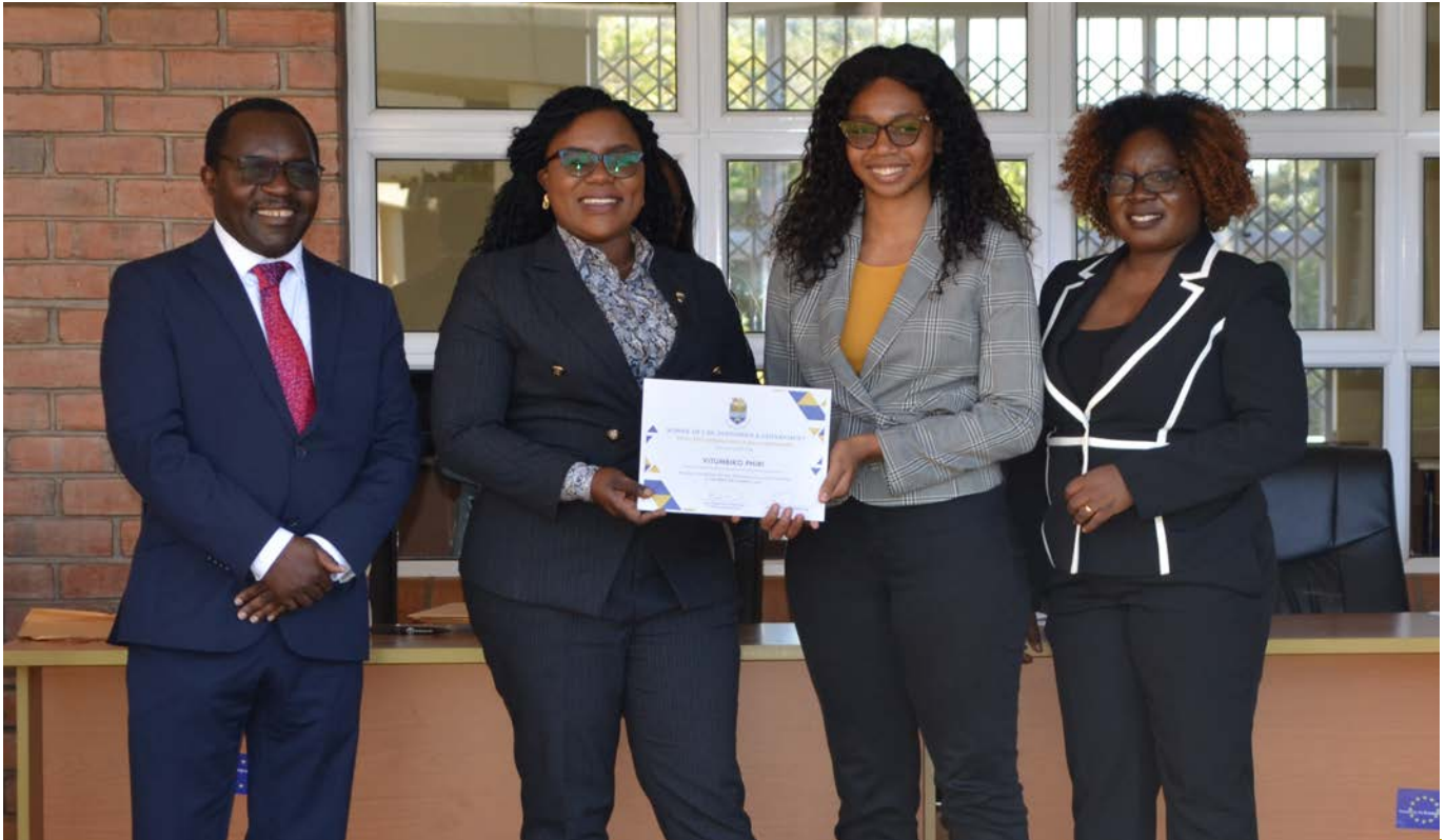
One of the students (2nd from right) receives her certificate