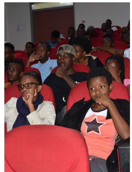
Some of the students at the lecture

The public lecture attracted many students from various departments. The lecture was also graced by lecturers from the School of Arts, Communication and Design, as well as graduates from the school.