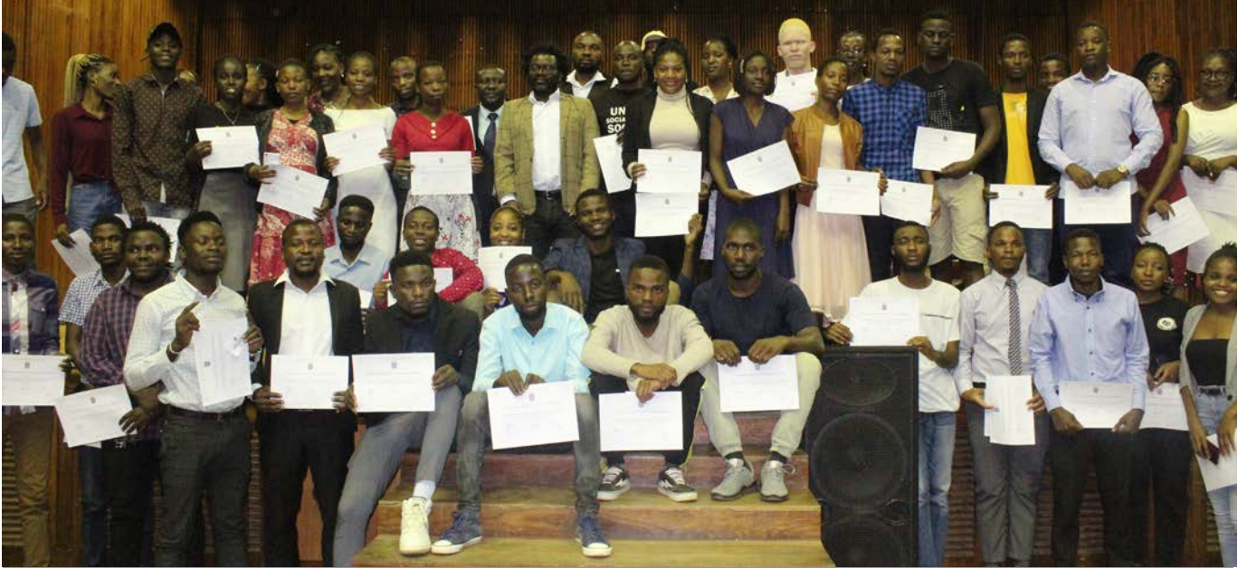
Award-winning students display their certificates