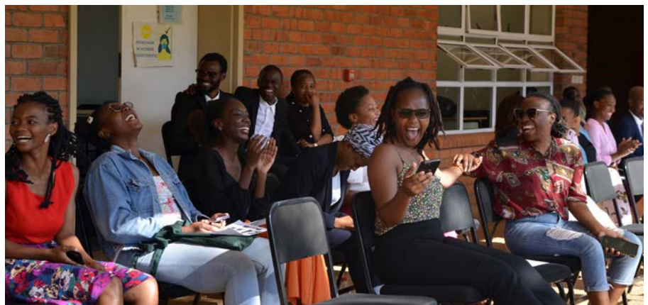
Cheering excellence awards

The legal studies at UNIMA continue to raise the institution's flag high, as students achieve successes in various international activities. In April of this year, students from the Law department emerged victorious in an Inter-university Moot Court competition against the Catholic University of Malawi.