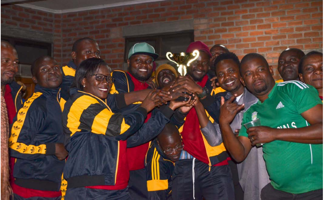
The UNIMA team displays their gold trophy