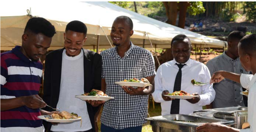
The Vice Chancellor with students at the buffet luncheon

The following day, the Vice Chancellor hosted a luncheon for the 14 exceptional students at his residence.