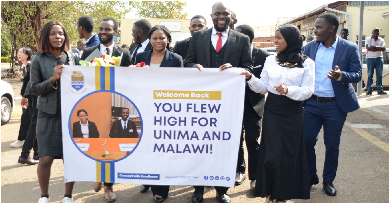
The Law students on their return home