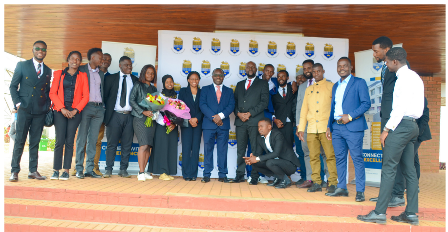
UNIMA's welcoming delegation poses with the students

The Nelson Mandela World Human Rights Moot Court Competition is an annual and global competition that brings together universities from all five United Nations’ regions to argue a given hypothetical case. The Moot Court is organized by the Centre for Human Rights of the University of Pretoria.