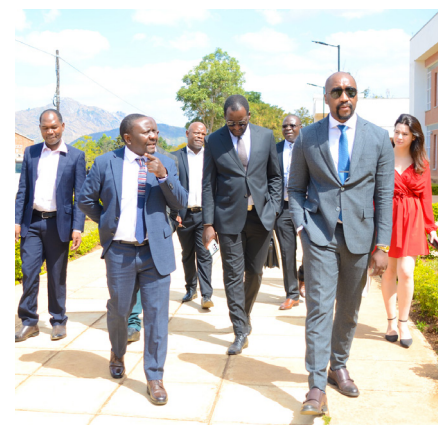
The VC takes the Astria Learning delegation on a tour of the UNIMA campus