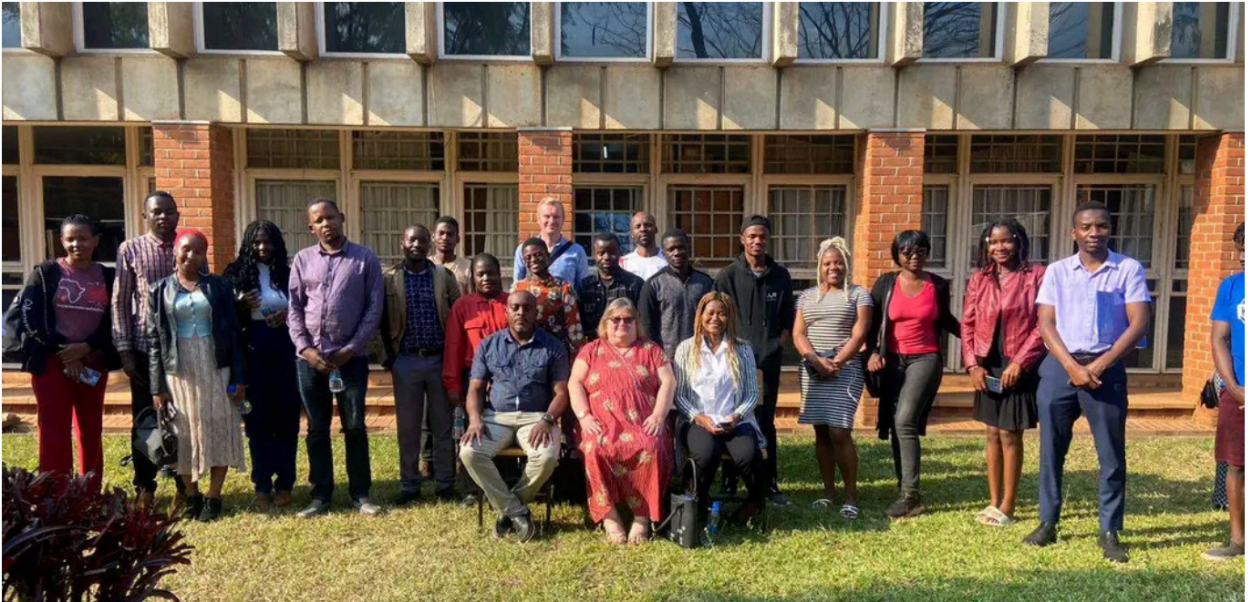
Social work scholars pose for a picture