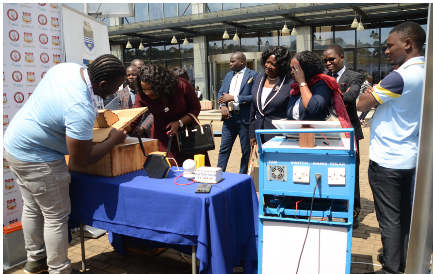
UNIMA exhibits its innovations at the function

On August 30, 2023, the University of Malawi was one of six public universities in Malawi showcasing various innovations at the Bingu International Convention Centre in Lilongwe (BICC). The National Commission for Science and Technology (NCST) provided a platform for these universities to display their innovations during the Grand Challenges Malawi (GCM) launch, held under the theme