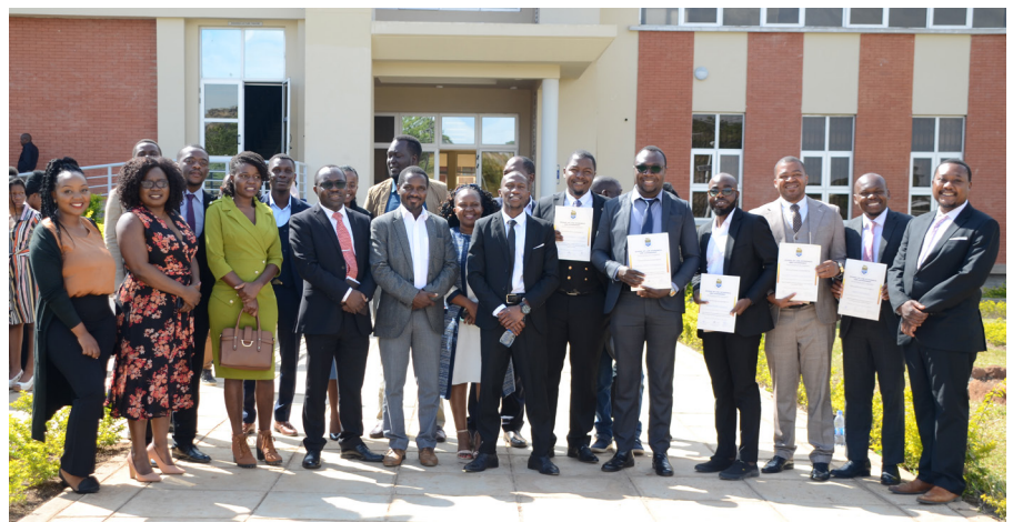
Award recipients pose with SLEG staff

At the end of the ceremony, the awardees were honored with excellence awards in various categories. The ceremony attracted many members of staff and families of the awardees who were present to celebrate with them.