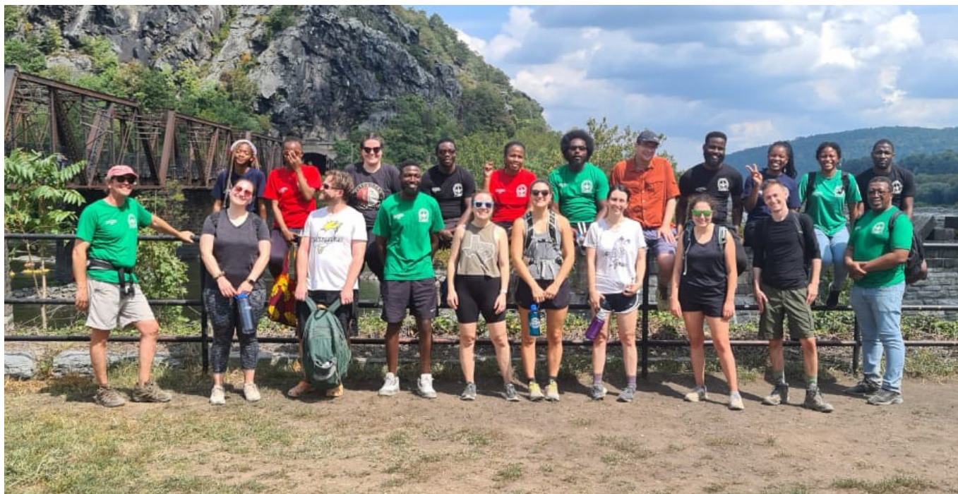
The UNIMA team poses with their hosts from University of Maryland