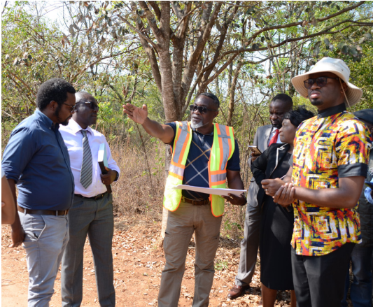
UNIMA management with the contractor at the proposed site

The University of Malawi, being an institution that enrolls high numbers of students, has often faced the problem of securing space for the conducting of lectures. To maintain the conducive learning environment enjoyed by its students, UNIMA, with