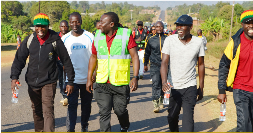
The VC leads UNIMA staff on the walk

As one way of fostering a healthy relationship among staff at the University of Malawi, the University of Malawi Staff Sports Association (UMSSA) organized a fun walk on July 28th, 2023. The fun walk covered a distance of 12km, starting from the University Office in Zomba City and ending at Songani, a popular trading centre outside the city.