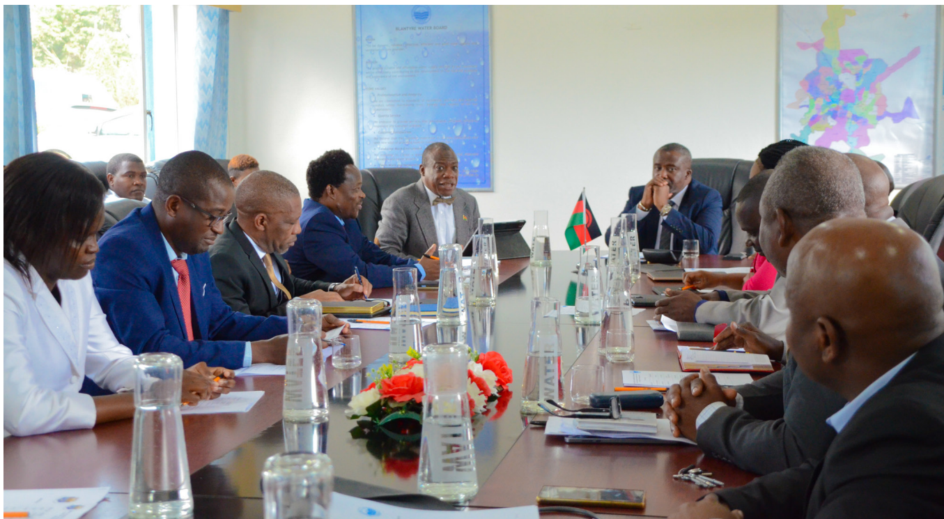
The MoU signing ceremony underway