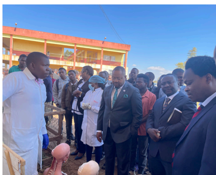
UNIMA delegates on a tour of UNIRovuma

The signing of the MoU paves way for the implementation of several joint projects,