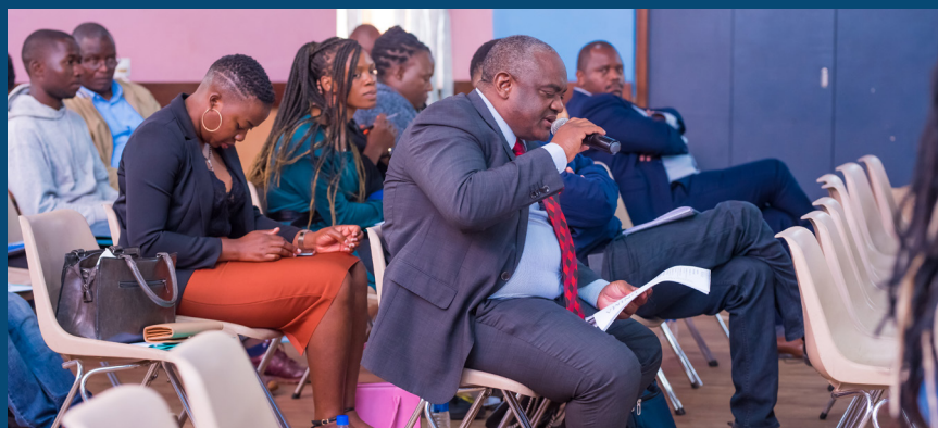
Members of the audience making contributions during the seminar

With this being the first event of its kind, there are plans to continue the tradition and involve stakeholders at every step of the planning and implementation process, so that future events are even better.