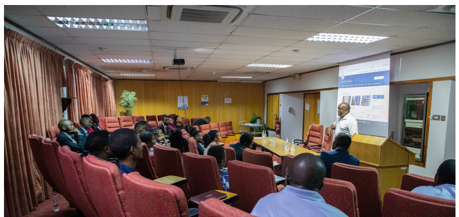
Discussions underway at RBM