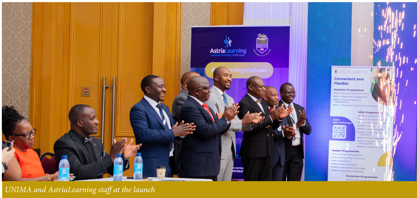
UNIMA and AstriaLearning staff at the launch