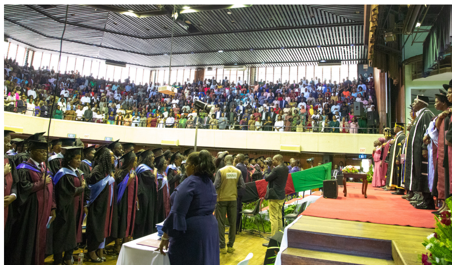
Graduands sing the national anthem

the past years. He mentioned that the institution has collaborated with various international universities and has welcomed international students who are currently studying at UNIMA. He also announced the establishment of the Alumni Office, which will foster alumni engagement. Continuing, he advised the graduands that as they venture out into the world, they should take pride in knowing they are not leaving UNIMA behind but rather carrying a piece of UNIMA with them. He sincerely congratulated all the women and men who received their awards.