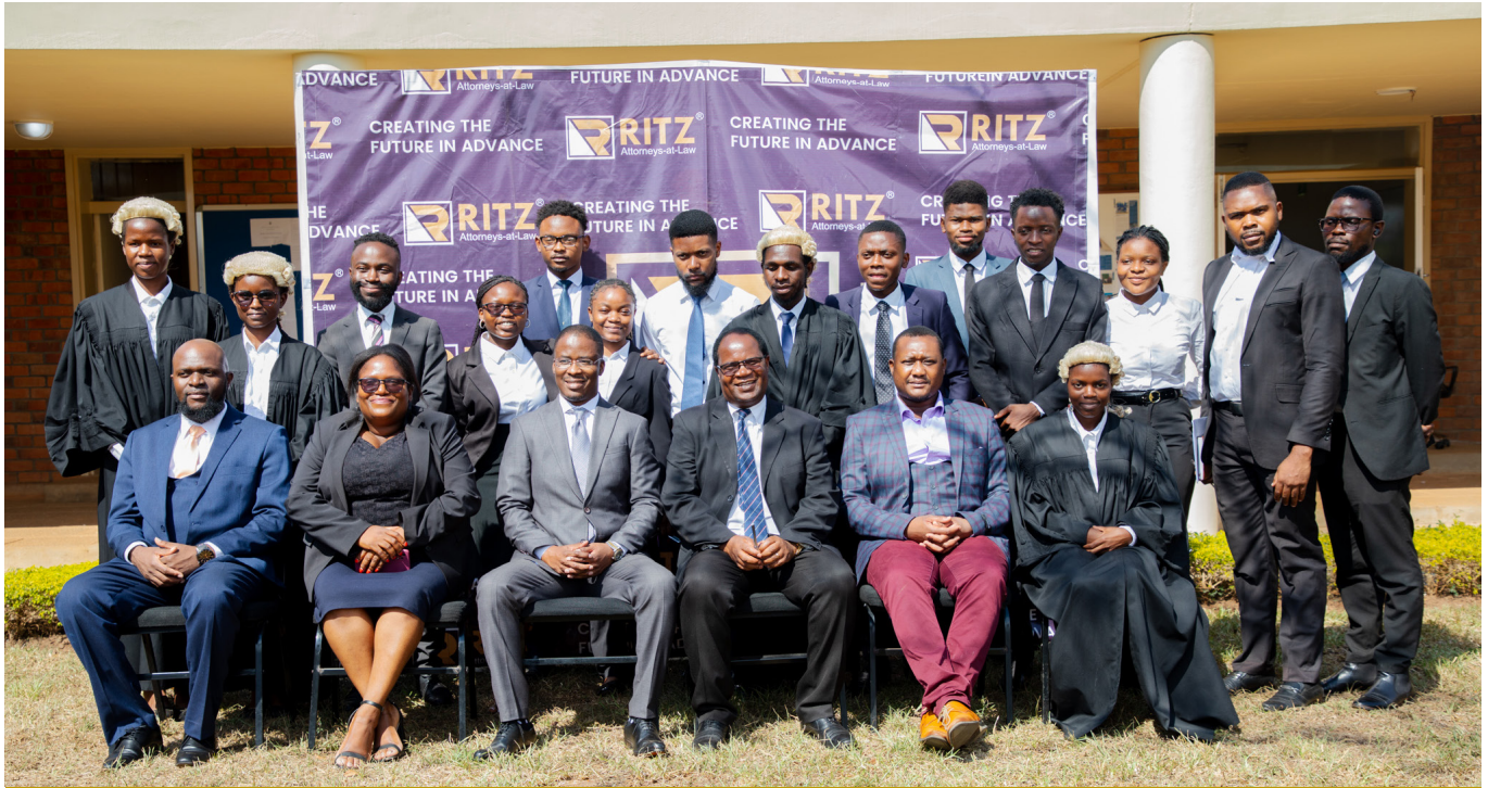
Law students, faculty, and RITZ staff pose for a picture