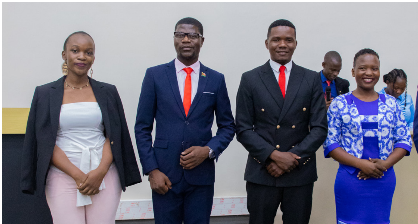
A section of the new UNIMA Student Representative Council