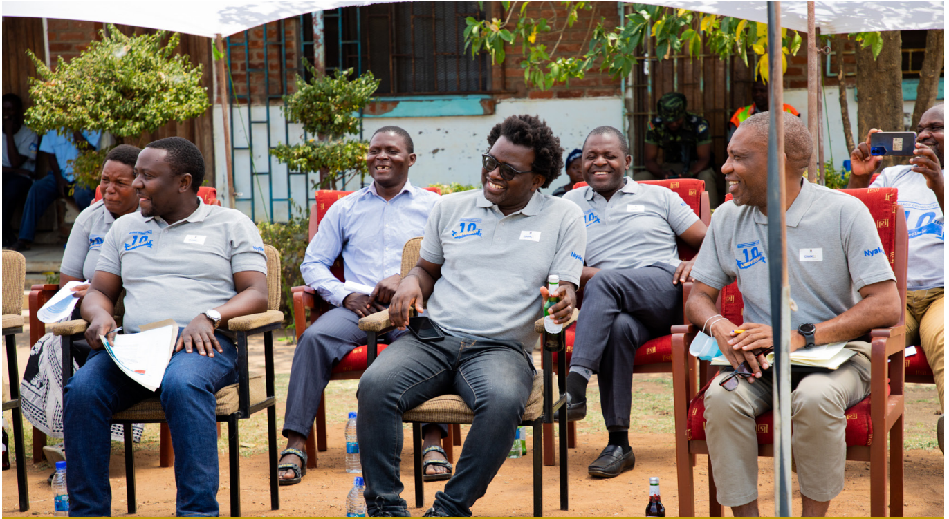
Part of UNIMA Management at the anniversary