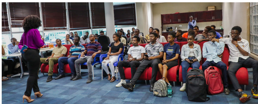
Physics students listening to a presentation at NBM

more about online transactions, including common errors faced in this domain. Finally, the students visited a room housing batteries with the aim of observing the ideal temperature for the efficient functioning of Uninterrupted Power Supply (UPS) systems.