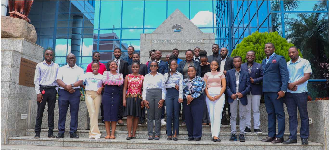
Striking poses in front of RBM: Actuarial Science students

In the course of their studies, University of Malawi students often have the opportunity to interact with and gain firsthand experience from potential employers. Not only do they acquire valuable experience, but they also showcase the skills and knowledge they have acquired during their years at the University. This is what happened on 24th November, 2023, when fourth year students from the School of Natural and Applied Sciences, specifically those pursuing Actuarial Science, visited the Reserve Bank of Malawi offices in Blantyre.