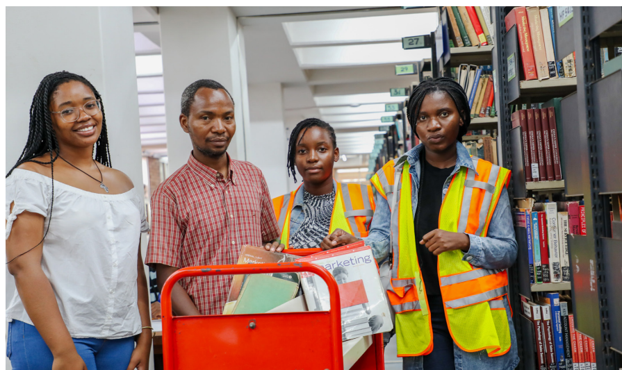
Student interns undergoing training in the library