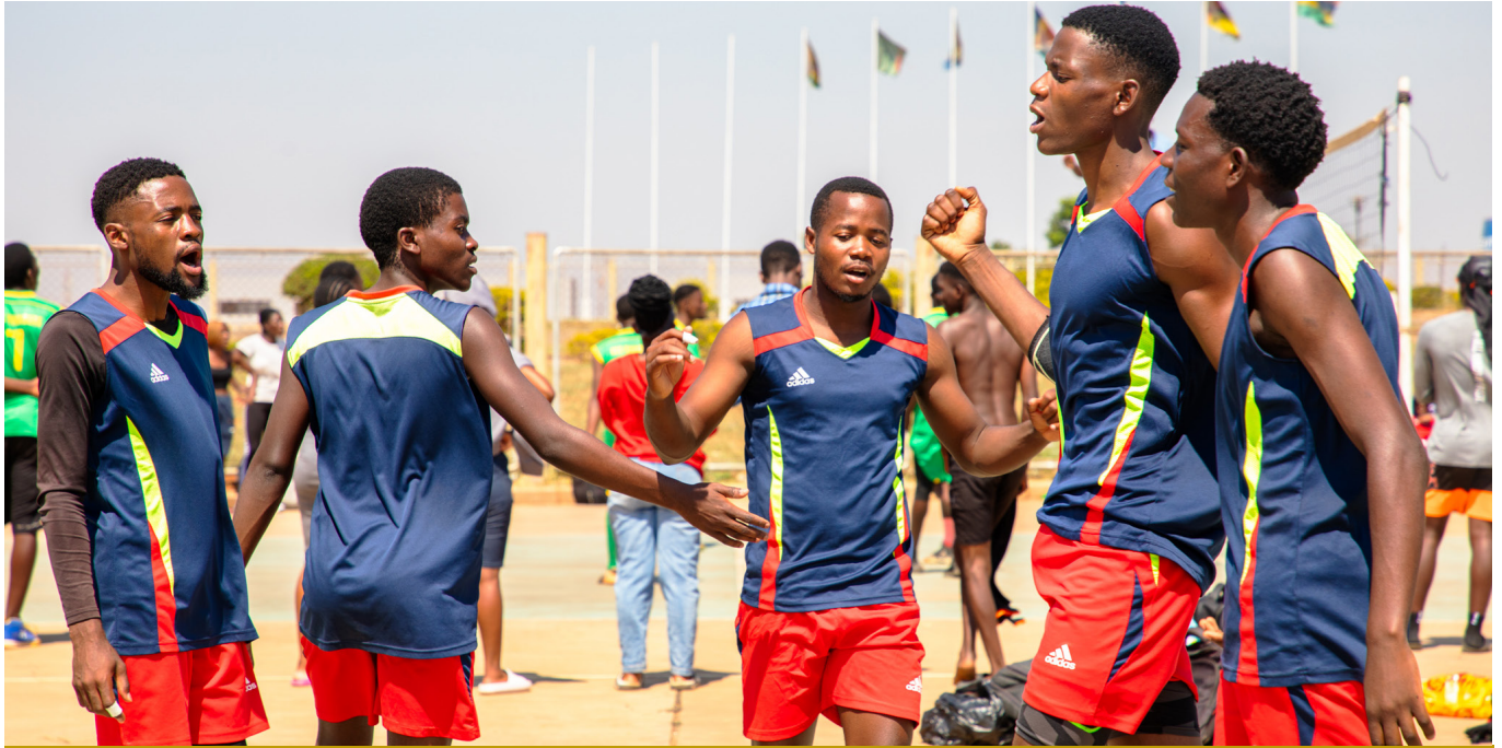
Some of the UNIMA athletes during the festival

Students from the University of Malawi excel not only in their studies but also in various competitions, including sports. On 4th and 5th November, 2023, UNIMA was among the 12 public and private colleges and universities that participated in the 2nd Sports Festival of the Tertiary Education Students Sports Association of Malawi (TESSAM), held in Lilongwe under the theme “Together we Thrive.” Over 400 students competed in various sports codes, including netball, football, basketball, athletics, and volleyball, among others.