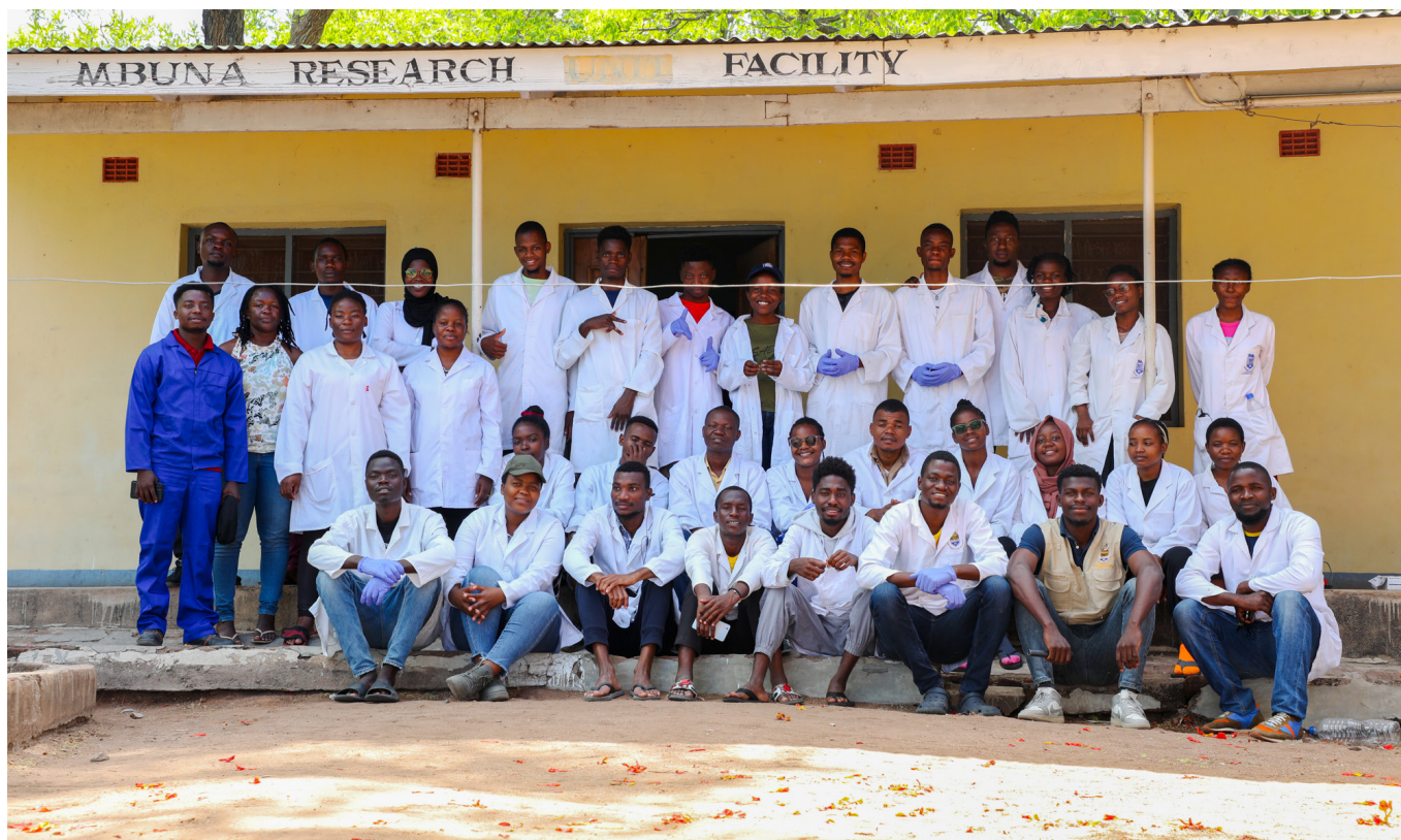
Students pose for a picture at Mbuna Research Facility