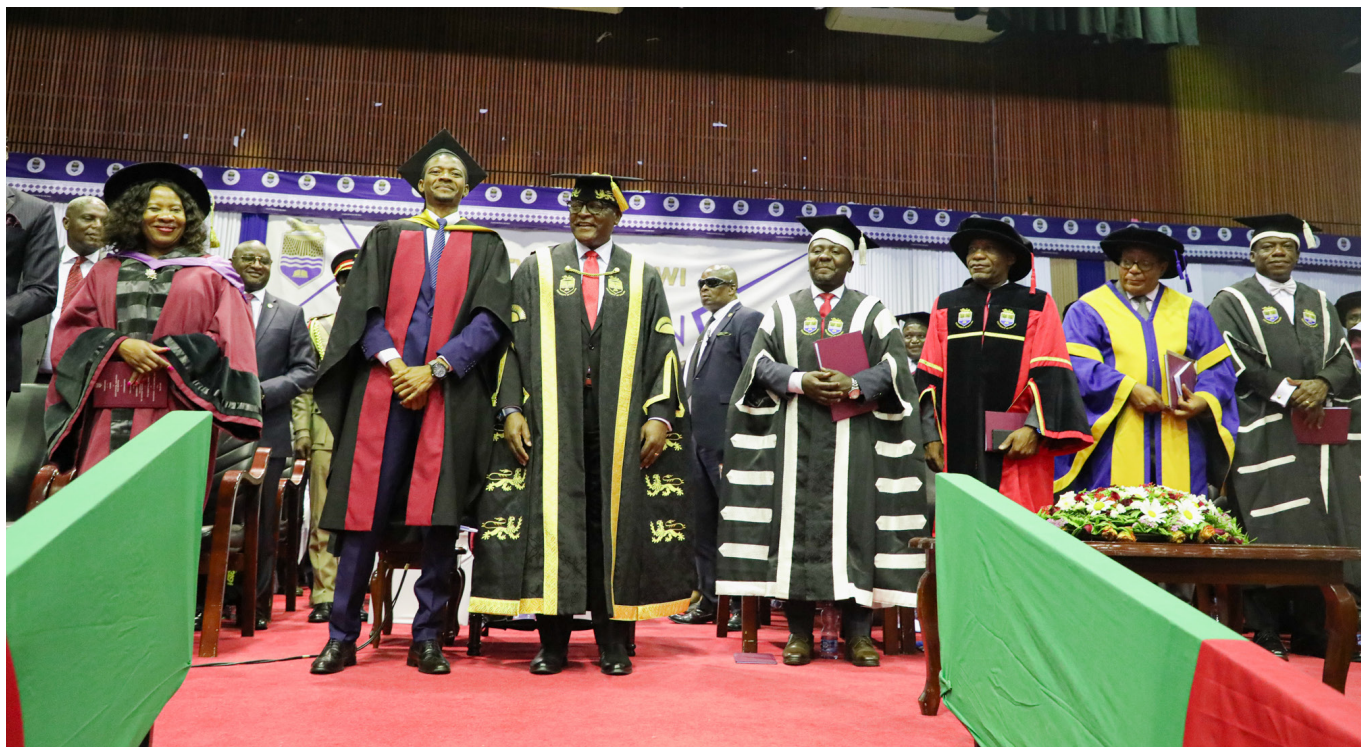
The Chancellor, Dr. Lazarus McCarthy Chakwera, joined by UNIMA leadership during the graduation