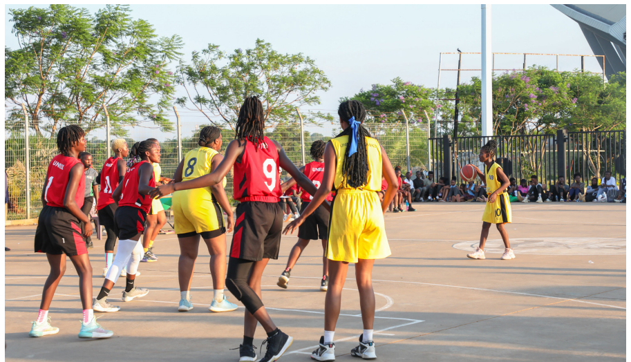
UNIMA female students showcasing basketball skills

UNIMA achieved victory in athletics, with Mr. Benedicto Saka, a third-year student pursuing a Bachelor of Communications and Cultural Studies, earning two gold medals for completing the 5000-meter and the 1500 meters. In other sports disciplines, UNIMA students secured silver medals by finishing in the second position in men’s football, women’s basketball, and netball. They also claimed bronze medals by attaining the third position in women’s volleyball.