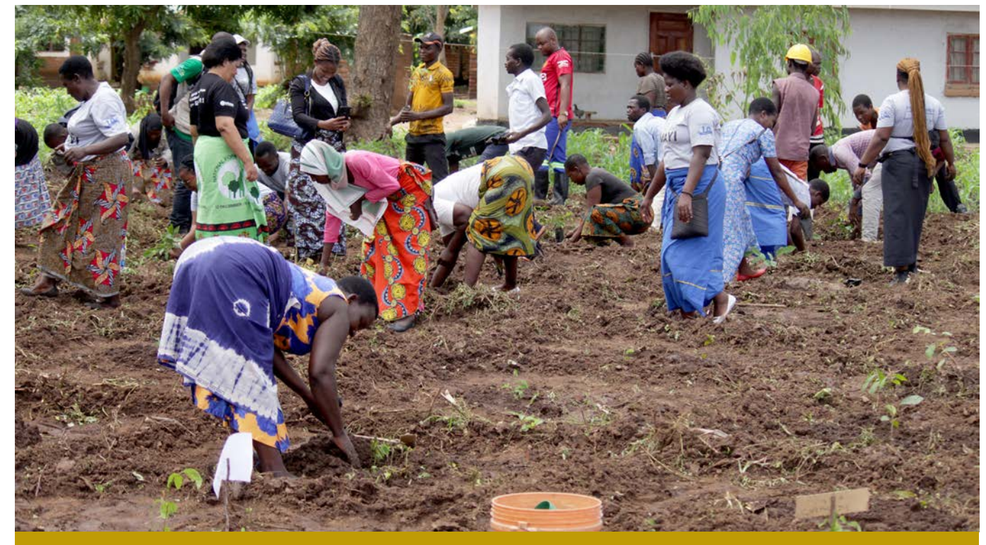
Participants engage in the tree planting exercise