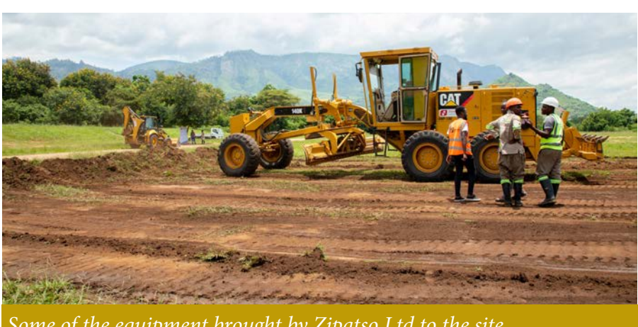
Some of the equipment brought by Zipatso Ltd to the site

He concluded by acknowledging the contribution made by Zipatso, as their actions reflect a shared vision for a better tomorrow, where corporate entities actively engage in uplifting communities and enriching lives.