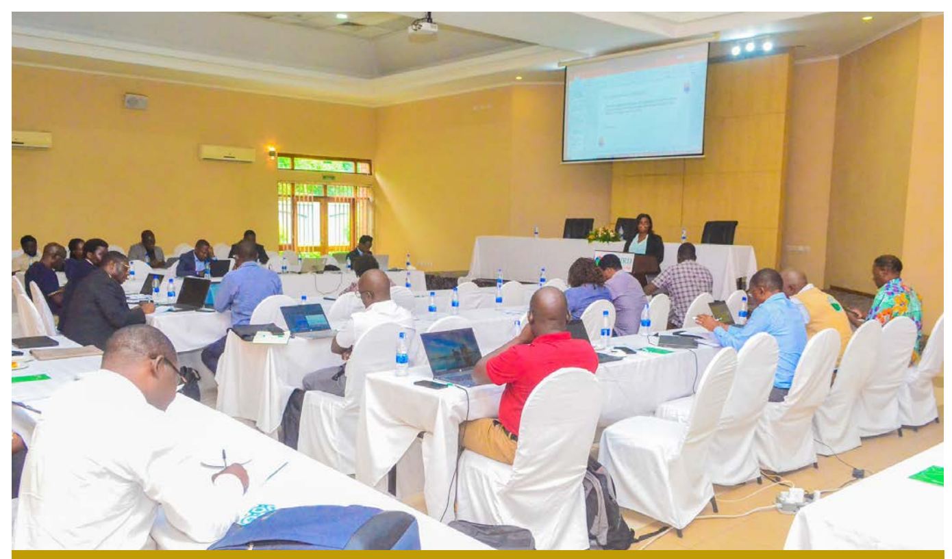
One of the programmes being presented to the audience