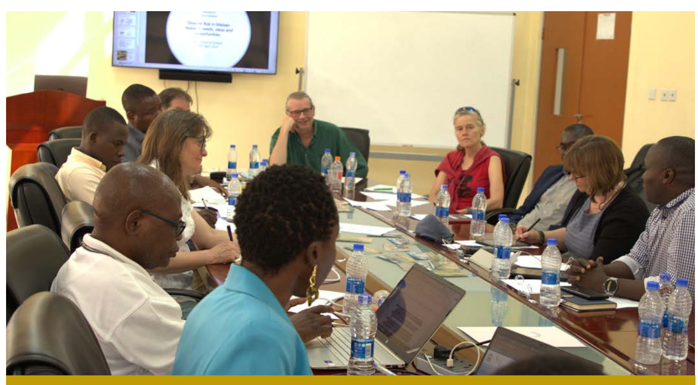
Participants engage in discussions on disaster management

Malawi, like many other countries, faces numerous challenges when it comes to disaster management. The loss of infrastructure, property, and human lives from 2023's Cyclone Freddy is still fresh in the memories of many Malawians. To delve into this crucial issue of disaster management, the University of Malawi, through the Department of Geography, Earth Sciences, and Environment, hosted a research roundtable titled "Disaster Risk in Malawi: Research Needs, Ideas, and Opportunities", on 19th April, 2024 at the Economics Building boardroom. This informal yet insightful discussion enabled the UNIMA academic community to explore the various facets of disaster risk reduction (DRR) in the country.