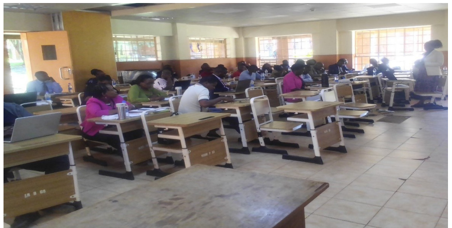
A cross-section of students during the proposal defense