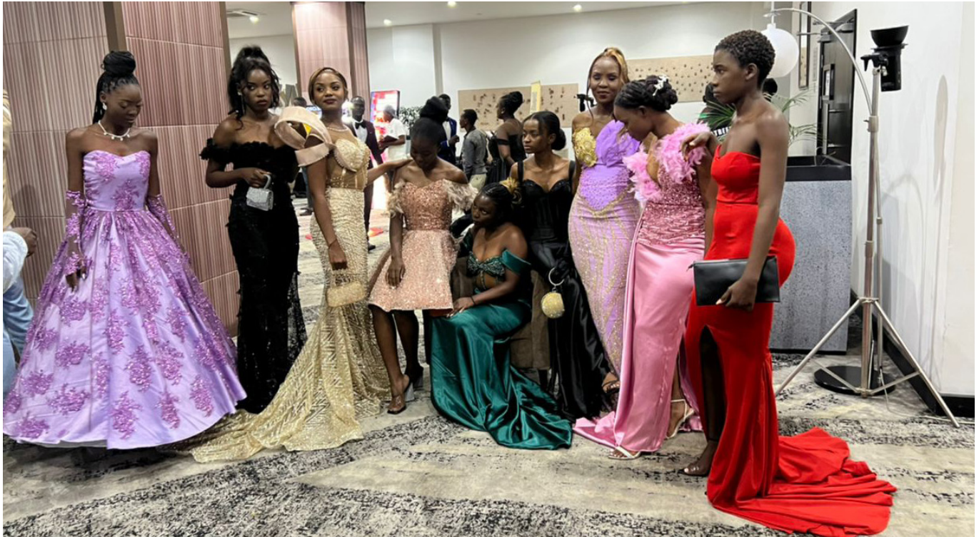
Some of the final year students at the dinner

UNIMA fourth-year students bid farewell to their alma mater with a grand finale dinner held at Amaryllis Hotel on the 26th May, 2023. The event brought together the Finales, celebrities and distinguished guests.