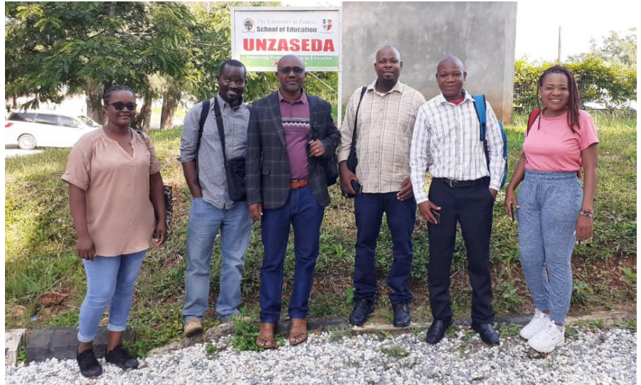
University of Malawi delegates pose for a picture at the School of Education, University of Zambia

The Triangle Agreement aims at fostering collaboration among the