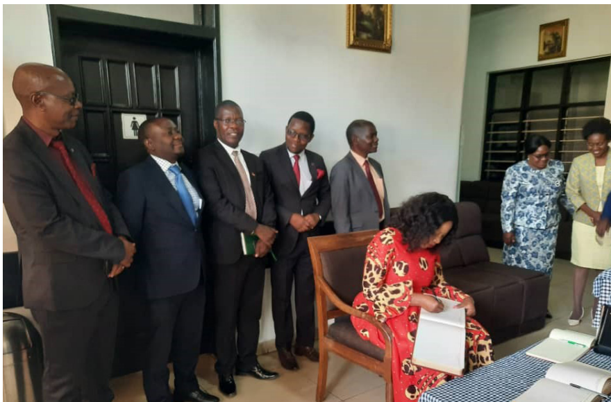
Hon. Madalitso Kambauwa Wirima (seated) and other delegates at the launch

The Minister of Education, Honourable Madalitso Kambauwa Wirima, MP, officially launched the Malawi Education Reform Programme on 30th May, 2023 at Hippo Lodge in Lilongwe. A teachers' parade buoyed