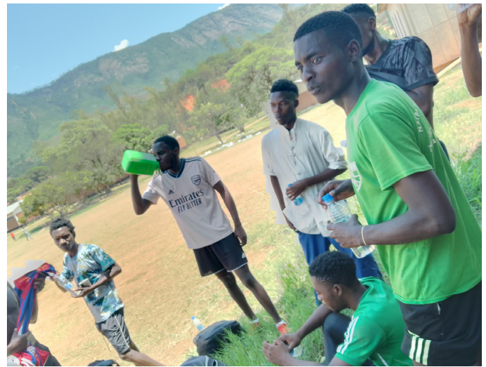
— PAS students at the Interclass Games

On Saturday the 25th of November 2023, PAS society held an exhilarating sports competition in netball and football. Students from different classes gathered to share their passion for sports. Students are faced with schedules dominated by exams and assign-