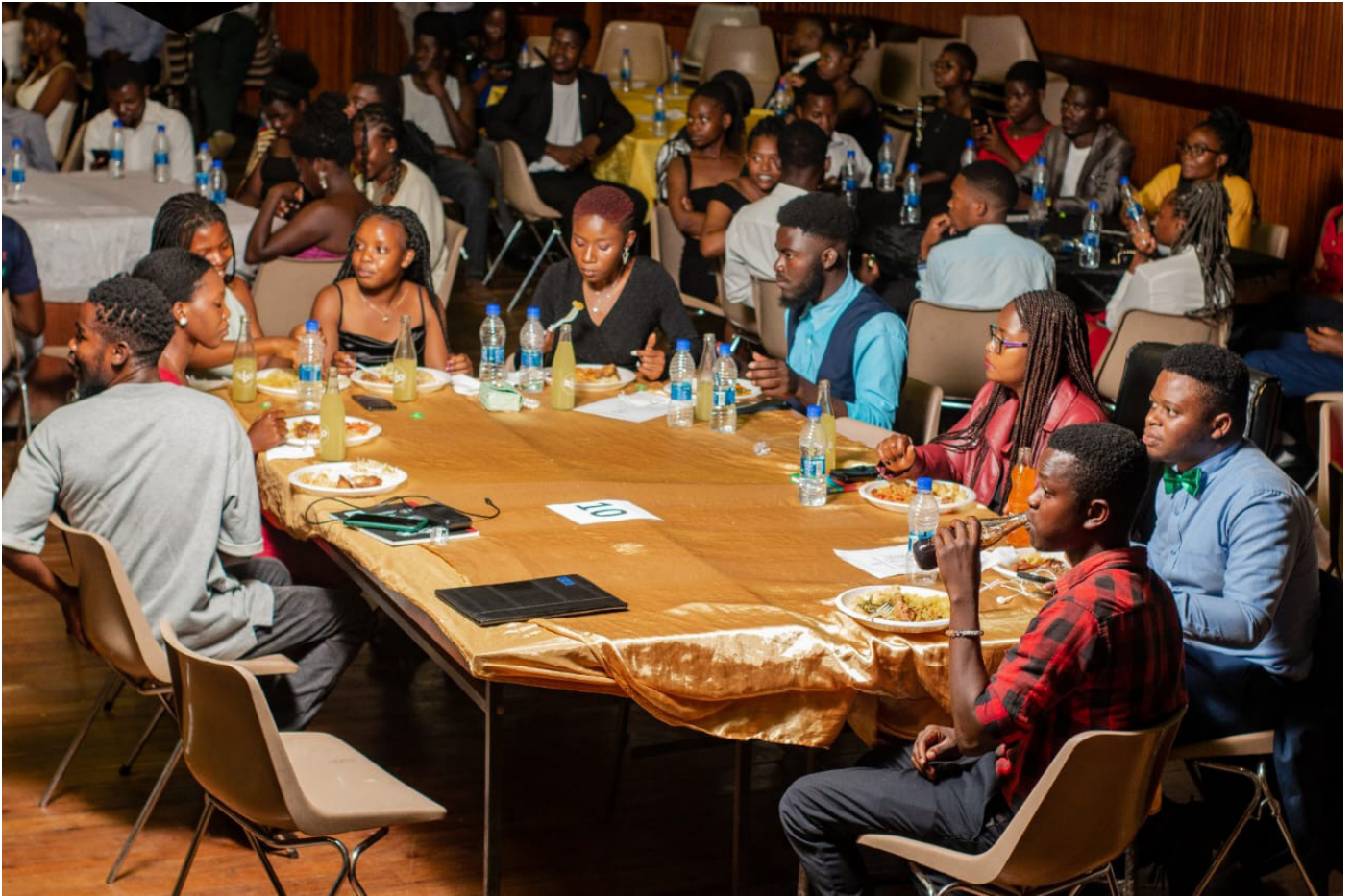
— PAS society students at the welcoming function