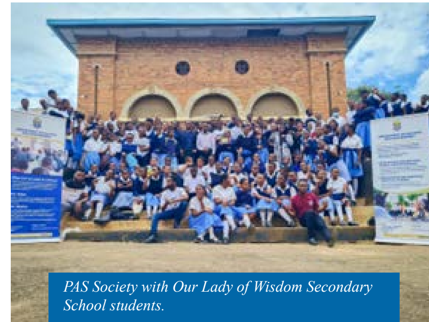
PAS Society with Our Lady of Wisdom Secondary School students.

The Political and Administrative Studies (PAS) Society successfully conducted a secondary school outreach program in Blantyre City on Friday, November 29, 2024.