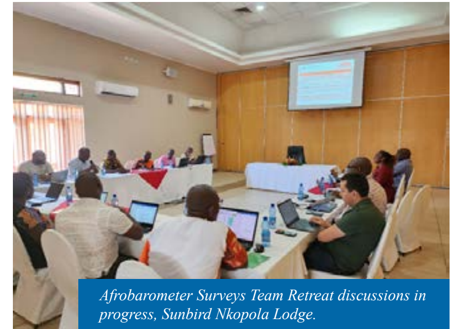
Afrobarometer Surveys Team Retreat discussions in progress, Sunbird Nkopola Lodge.

The retreat was an opportunity for the team to reflect on the work done in the current calendar year, identifying success and challenges, and to strategize for the upcoming calendar year of 2025. Among the key highlights was the recognition of the number of surveys completed in 2024, which have covered 28 countries—an average of 2.5 countries surveyed per month; the fielding of additional surveys that include a pre and post-election survey in South Africa; seven special surveys fielded under the Digital Transformation Africa project and a further three special surveys fielded under the Young Africa Works project.