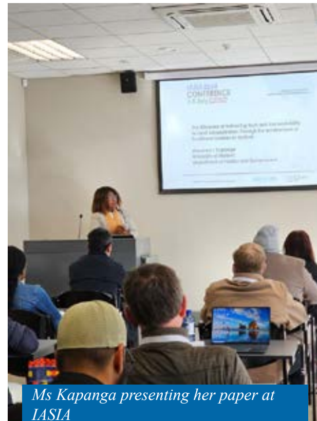
Ms Kapanga presenting her paper at IASIA

The paper examines the contested role of traditional leaders in land reform and administration in the context of an African country, Malawi. Specifically, the paper critically interrogates the dilemma of balancing trust and accountability in land administration through the involvement of traditional leaders in Malawi. Traditional leaders play a significant role in customary land in many African countries and are often regarded as trustworthy figures given their long-standing positions of authority and cultural ties. Despite this trust, concerns about corruption and accountability persist. Studies suggest that traditional leaders may abuse their power for personal gains or engage in rent seeking behavior related to land allocation and management. Using the social capital theory as the theoretical framework, the paper argues that authority of traditional leaders stems from both historical precedent and ongoing social interactions imbuing them with a significant level of trust among local populace. There exists a widespread perception surrounding their involvement in land administration, fueled by various factors includ-