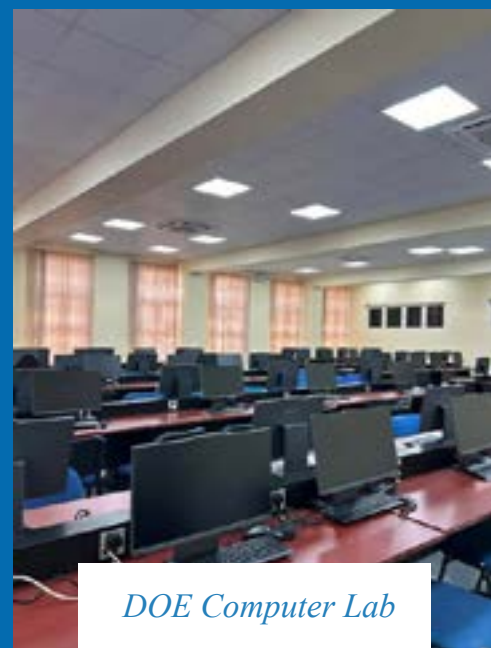
DOE Computer Lab

The Department of Economics is excited to announce the procurement of new computers for its labs. This initiative aims to promote inclusivity and enhance educational quality by providing equal access to technology. "Lack of a computer should not be an option for failure," highlights the department's commitment to ensuring all students have the necessary resources for success.