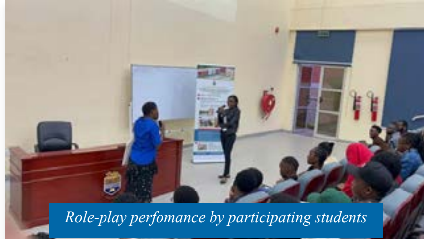
Role-play performance by participating students

The world is changing, and the future remains uncertain—a sentiment shared by many young people today. In response to this reality, the Department of Economics, through the Economics Society in collaboration with the Social Work Society, organized a talk on the importance of saving among students. The event began with a lively debate on the topic, allowing students to share their perspectives and insights on the value of saving.