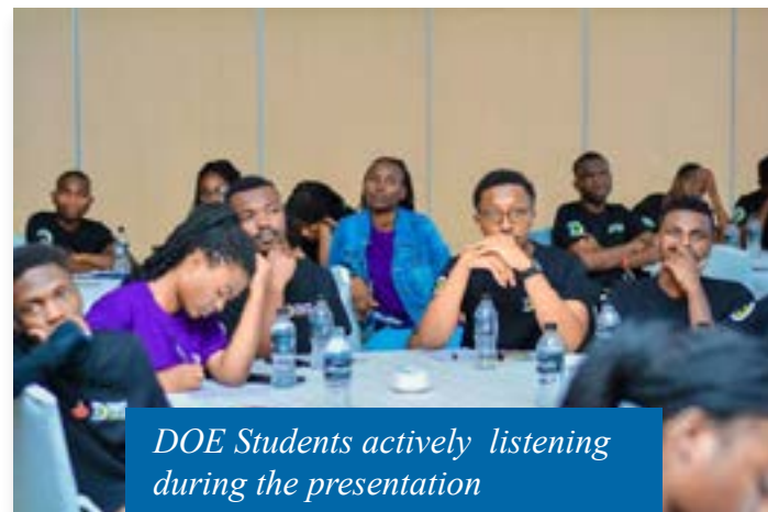
DOE Students actively listening during the presentation