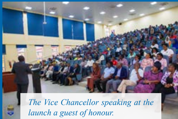
The Vice Chancellor speaking at the launch a guest of honour.